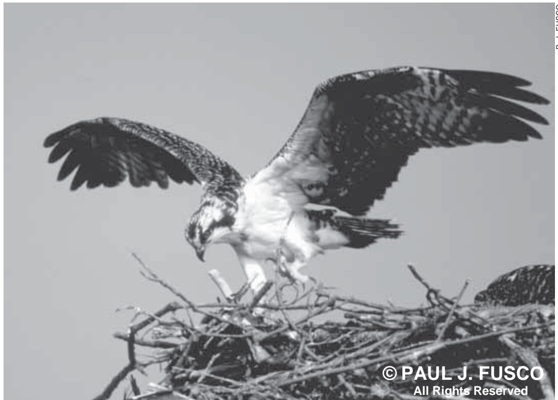
The osprey is one species that has benefitted from the protection and management of Connecticut's coastal resources.

DEP's Office of Long Island Sound Programs administers the coastal management program which is approved by the National Oceanic and Atmospheric Administration under the