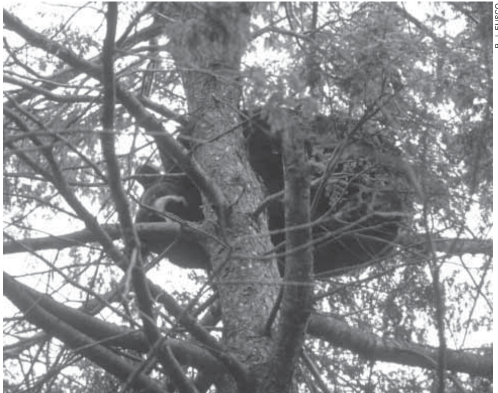
P. J. FUSCO

Before this female black bear was captured in Litchfield in May 2000, it had caused problems in Massachusetts and had also been seen in Vermont. The female had two cubs with her at the time she was captured.