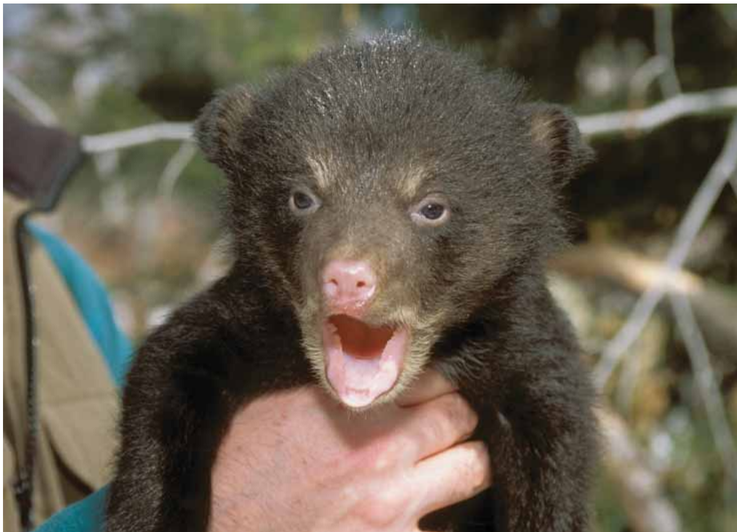
Meet one of Connecticut's newest black bear cubs! This cub was one of 17 that were examined by Wildlife Division biologists this past March and April. To learn more about how the cubs were found and why, see page 4 of this issue.

Bureau of Natural Resources / Wildlife Division Connecticut Department of Environmental Protection 79 Elm Street Hartford, CT 06106-5127