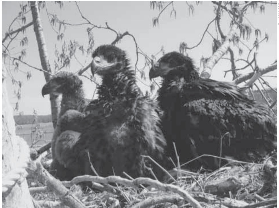
The three eagle chicks from New London County are sitting in the nest in the order they were banded in late April. Meet P7P, P8P and K9K!

All of the other active eagle nests are on private property. The Division does not disclose the exact locations of nests to protect the eagles from disturbance and out of respect for the landowners who do not want trespassers on their land. The other nests are in Middlesex, Litchfield and Hartford Counties.