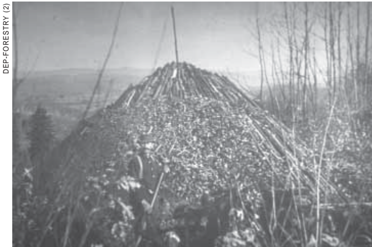
Charcoal mounds, like this one in Burlington, once dotted the smoky, clearcut landscape. This practice helped regenerate the oak forests that are so common today.

The year should prove to be a fulfilling one for all Connecticut wildlife and forest enthusiasts. The DEP will work harder than ever to reach its citizens and bring them closer to nature, their land and their heritage. And, the DEP hopes Connecticut residents will broaden their horizons and learn a lot while enjoying themselves.