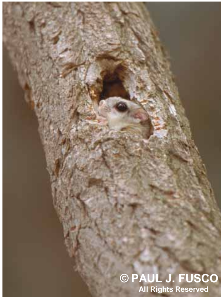
Northern and southern flying squirrels look very similar and require a great deal of practice to tell them apart. The southern flying squirrel, which is found throughout the state, is the more common of the two.

Northern flying squirrels are typically associated with a type of forest called the northern hardwood and coniferous forest. The trees that are usually found in these forests include white pine, red spruce, balsam fir, sugar