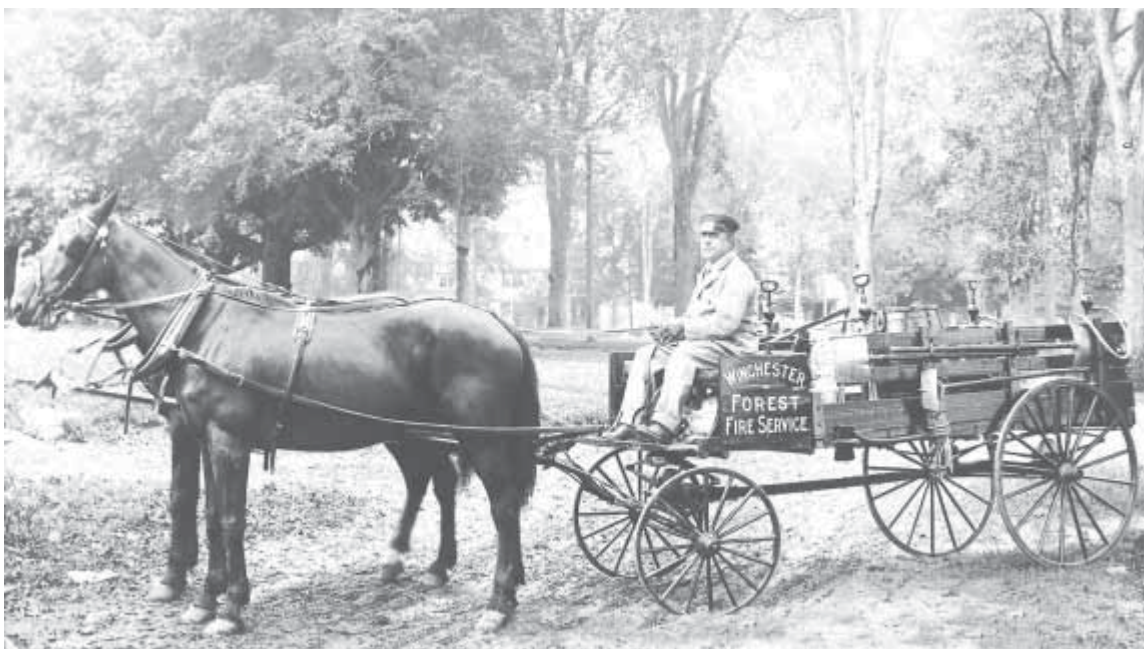
There were many large, destructive forest fires in Connecticut in the early 20th century. It became apparent that reforestation programs had to include fire control. This innovation was an early fire suppression vehicle.

2003 marks the 100 th anniversary of Connecticut's state forests and the practice of forestry in the state. All year long, the DEP will promote the Connecticut Forestry Centennial in recognition of this accomplishment. The