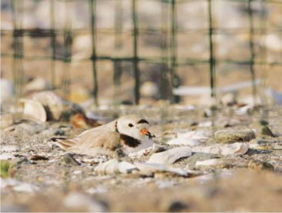
This piping plover and its nest are protected by a wire mesh enclosure that keeps out predators and prevents beach visitors from stepping on the well-camouflaged nest.

It all began in early April. As a Master Wildlife Conservationist eager to log some volunteer hours, I sat in with 30 or so other volunteers for piping plover/least tern monitor training at the Connecticut Audubon Coastal Center at Milford Point. There we learned that piping plovers and least terns are both threatened species in Connecticut that need to be protected if they are to successfully nest and fledge young.