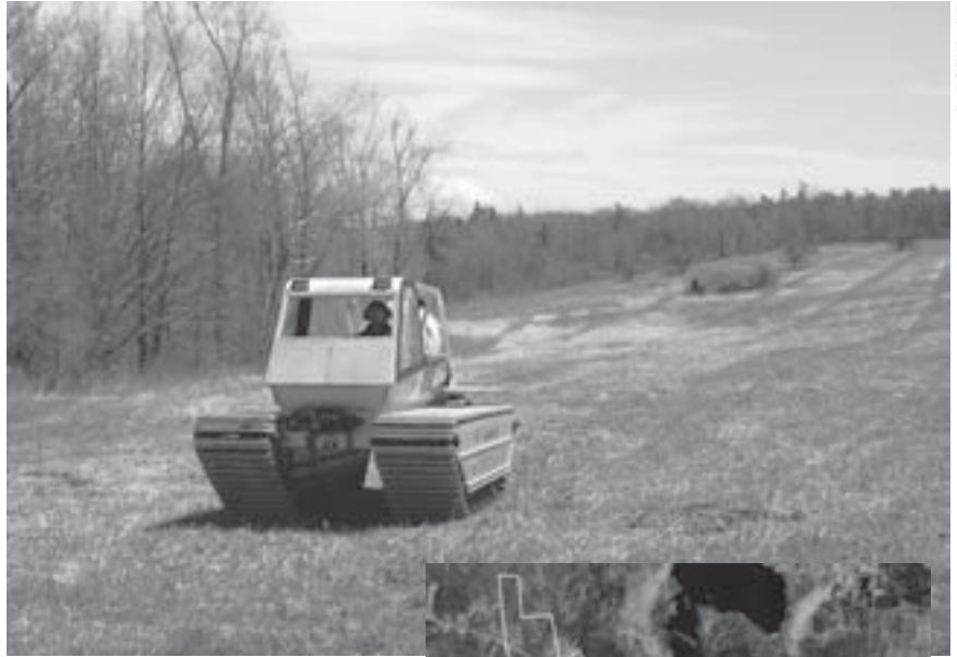
This special low ground pressure mower was used to mow the wet meadows at Goshen WMA. It leaves no tracks and does not impact the wetland soils in the meadows.