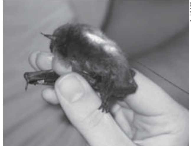
Using surgical adhesive, radio transmitters were attached to the back of captured female Indiana bats, allowing biologists to track their movements from several miles away.

On the following day, the airplane flew again in an attempt to pinpoint where the bats stopped to roost for the day. Once they were detected, searches were conducted on the ground to determine each bat's exact roost location. Then, in the evening, crews returned to the roost site. If only one bat left the roost, it suggested that the roost