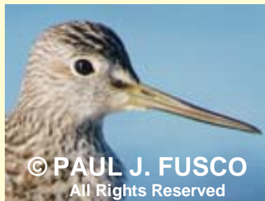
© PAUL J. FUSCO All Rights Reserved