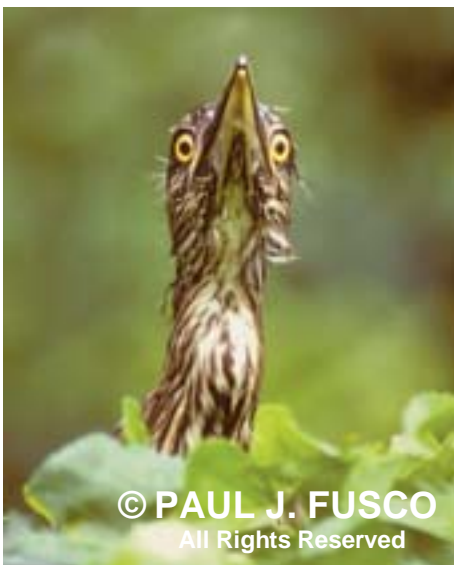
P. J. FUSCO

The DEP issued an emergency closure of Charles Island in Milford and Duck Island in Westbrook in July to prevent the continuing human disturbance of several state-listed nesting birds at these islands, including snowy egrets, great egrets, glossy ibises and little blue herons. The islands, which will be closed to public access until September 9, 2005, will be patrolled by DEP Conservation Officers. Anyone caught trespassing on the islands will be arrested. The public can help in this effort to protect the nesting birds by following the emergency closure and reporting any observed violations at 1-800-842-4357.