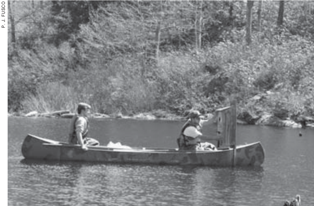
P. J. FUSCO

The hooded merganser, which is the smallest of the North American mergansers, is another waterfowl species in Connecticut that uses wood duck nest boxes. The hooded merganser population was in decline at the turn of the 20 th century due to unregulated market hunting and logging. However, this species' ability to also use nest boxes has allowed it to expand both its breeding population and range. In the western portion of the state, hooded mergansers were found in 7% of the usable boxes, while on the eastern side, only 2% of the boxes were used by hooded mergansers.