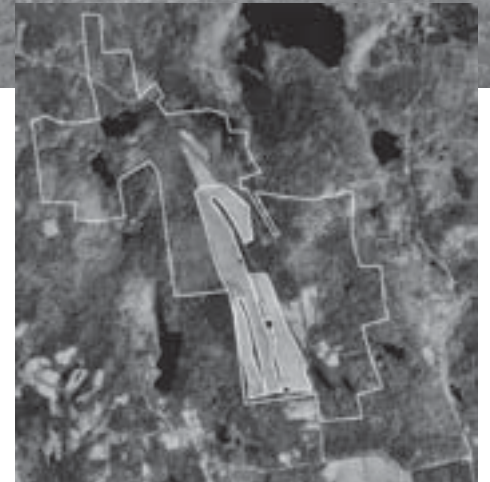
This aerial view of the Goshen WMA shows where mowing to maintain and enhance grassland habitat was conducted (shaded area). This project was made possible through a grant from the U.S. Fish and Wildlife Service.