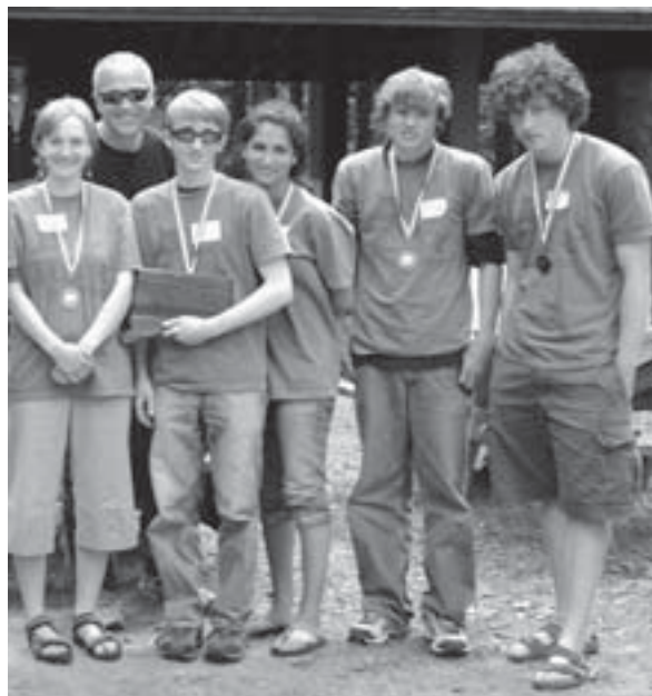
The top scoring team in the 2005 Connecticut Envirothon was from Litchfield High School.

Preparation for the Connecticut Envirothon occurs during the school year where each team studies the environmental