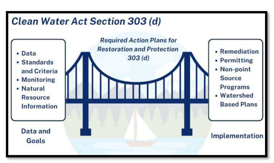
Figure 1. CT WQAP Bridge the Gap

(WQAP) serve as a bridge to connect the Water Quality Standards (WQS), data, monitoring and other natural resource information to implementation though various DEEP programs including Permitting, Remediation, Non-Point Source Programs and Watershed Based Plans (Figure 1). Under the federal Clean Water Act, the 303(d) Program develops three types of Water Quality Action Plans. The primary planning tool of the 303(d) program is the development of Total Maximum Daily Load based plans (TMDLs) to restore and protect water