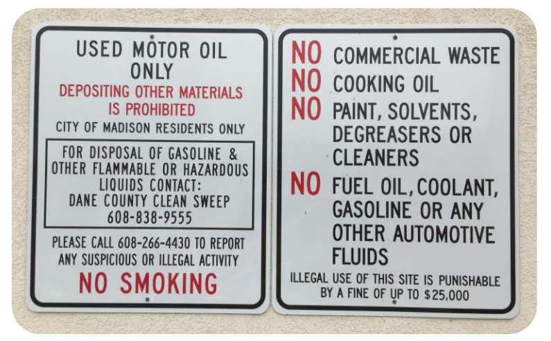
New signs posted at a city of Madison used oil collection site.

The city expects to further invest in dual-compartment tanks when they upgrade all of their public used oil drop-off sites. Once upgrades are made, city residents will be able to continue to drop off used oil when a full compartment is locked out after sampling.