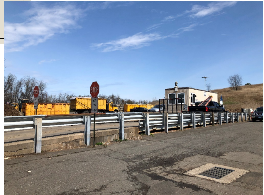
GOOD WILL STORE & RECYCLING CENTER