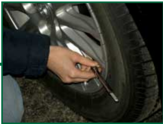
Use a gauge to check your tire pressure.

Information on CT's law requiring gas stations to provide free air – www.ct.gov/dmv (Type in "free air" in the search block.)