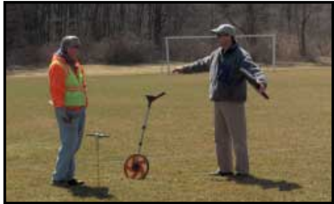
OLC Professional conducts site assessment with Manchester

Following the distribution of its Organic Land Care DVD, DEP solicited applications from municipalities interested in participating in a pilot project to demonstrate organic practices on a school or municipal recreation field. The selection process included a point rating system for the application's questions followed up by on-site interviews with the three top-rated municipalities. Over 30 municipalities throughout the state applied to participate.