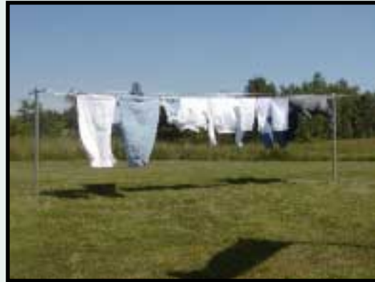
The ultimate energy-saving clothes dryer