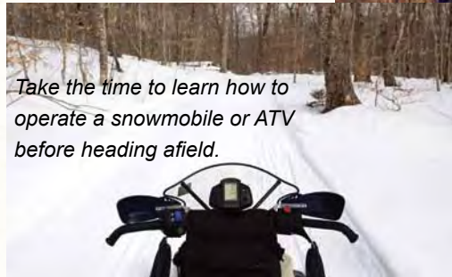
Take the time to learn how to operate a snowmobile or ATV before heading afield.