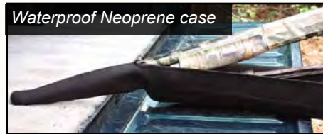
Waterproof Neoprene case