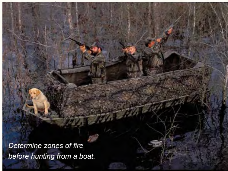
Determine zones of fire before hunting from a boat.