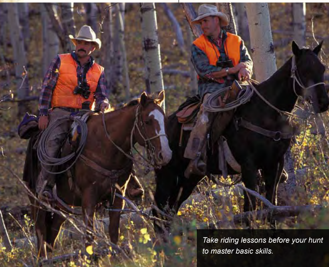
Take riding lessons before your hunt to master basic skills.