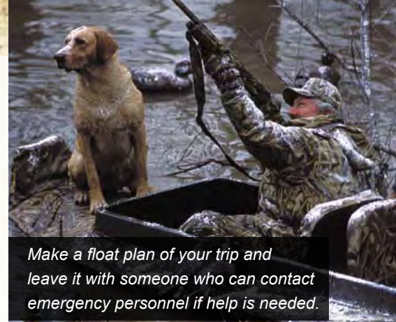
Make a float plan of your trip and leave it with someone who can contact emergency personnel if help is needed.

changes in placement of gear and people.