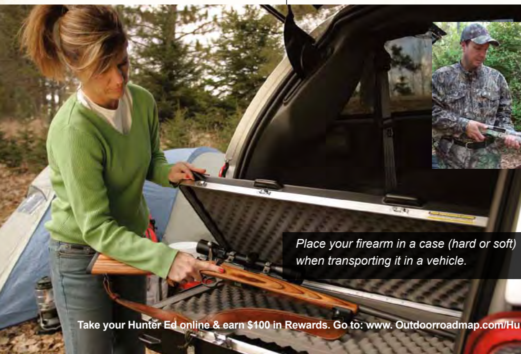
Place your firearm in a case (hard or soft) when transporting it in a vehicle.

home, conduct the same safety check—control the muzzle, open the action and check for ammunition—before bringing it to storage or to the workbench for cleaning.