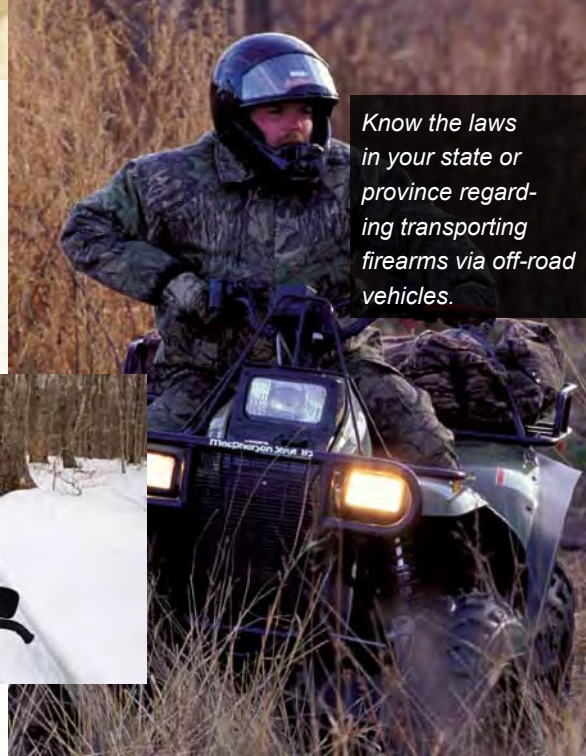
Know the laws in your state or province regarding transporting firearms via off-road vehicles.

snowmobile, the firearm must be securely stored on the off-road vehicle, freeing both hands for driving. A gun rack designed for safe and secure transport of the firearm should be firmly attached to the vehicle. To protect the firearm from bad weather and debris, store the gun in a case or scabbard and secure the case to the gun rack.