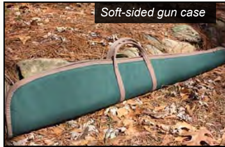
Soft-sided gun case