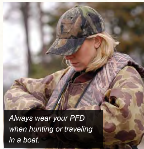
Always wear your PFD when hunting or traveling in a boat.