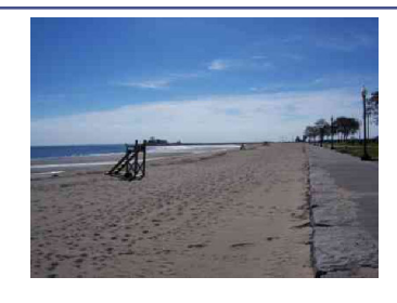
Additional Site Information: City of Bridgeport 7 Trumbull Road Bridgeport, CT 06611

From the West: Take I-95 North to exit 27 Lafayette Boulevard/Downtown 0.1 miles. Turn right onto Myrtle Avenue. Turn right onto Railroad Avenue 0.1 miles. Turn left onto Park Avenue 0.4 miles.