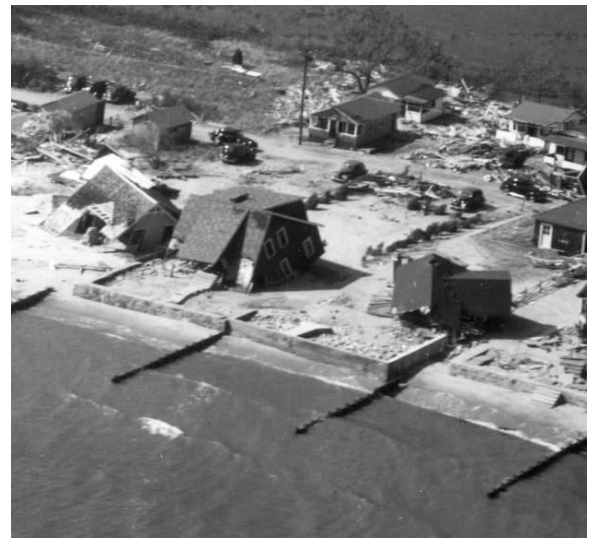
Storm damage from the 1938 hurricane.

Although hardened shorelines may be necessary to protect primary infrastructure they should be used sparingly as their protective value may be short lived and counterproductive.