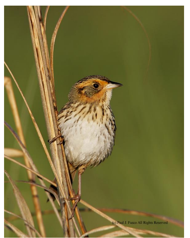
Saltmarsh sharptailed sparrow

To sustain viable populations throughout the progression of climate change, it will be necessary to maintain enough quality habitat over time. This is literally a moving target that will require bridging current habitats to future locations. For example, rising sea level along the Connecticut coast could jeopardize the saltmarsh sharptailed sparrow. Connecticut has the largest percentage of the world's population of this species and sea level rise will increase the risk of nest flooding. In order to sustain breeding populations of these sparrows, coastal buffers must be established to facilitate an inland expansion of coastal wetlands where this species occurs. (Coastal habitats are discussed further in the Natural Coastal fact sheet).