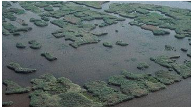
Example of wetland loss from submergence of the Quinnipiac River marsh in LIS. Wetland loss should increase with accelerated sea level rise.

wetlands are one of the most productive habitats on the globe, second only to rain forests. They developed several thousand years ago when sea level rise rates slowed to 1 mm/yr. Under the two millimeter rise of the past century, most persisted except for areas in western Long Island Sound where the lower elevation grasses have been converting to mudflat over several decades. Marshes can keep pace with sea level by accumulating sediment and building soil with roots but scientists do not know at what sea level rise rate marshes will drown. The highest forecasts of 15 mm/yr (0.6 in/yr) are very likely to cause marsh grass drowning making future tidal wetlands only narrow fringes. It is expected that there will also be a loss of plant diversity and regional genetic stock.