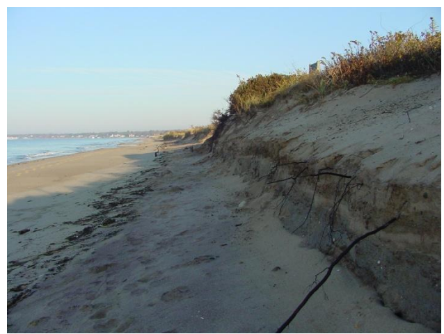
Hammonassett October 2008

To make our shoreline and its communities and habitats more resilient, existing conceptions of property rights and regulatory authorities must New approaches must be be reevaluated. considered in light of the need for tailored and thoughtful variation in response to rising sea levels and more frequent and intense storms. New or revised policies for establishing clear standards and encouraging sustainable and economically viable outcomes regarding shoreline armoring versus retreat, proactively protecting habitats and ensuring responsible growth are all part of what Connecticut needs to be doing as part of an adaptation strategy in the face of a changing climate. The CTDEP can lead by example through fully evaluating proactive measures, including the potential for retreat as an option to protect natural coastal habitats in state managed lands.