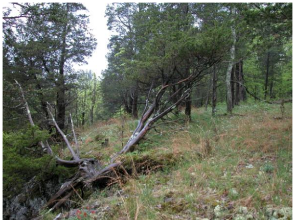
Grassy glades such as this opening on a trap rock ridge have a large diversity of spring wild flowers.

necessary for their long flights. It is conceivable that if their food sources are not available within the right window of time, some warbler populations will diminish. The success of these migratory species correlates to the timing of leaf-out and the associated emergence of insect populations that occurs in spring. (For more related information see the Wildlife fact sheet where bees and other pollinators are discussed).