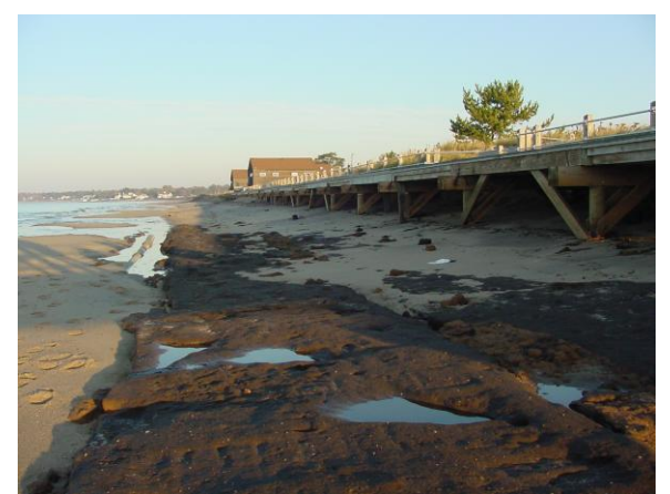
Hammonassett October 2008

Boating – While projections point to more frequent and intense storm events, overall summer time precipitation is not expected to increase. However, with rising temperatures and increased evaporation rates, short-term drought conditions are expected to be more frequent. Coupled with ever increasing demands on the state's water resources, freshwater paddle sports such as canoeing and kayaking could be impacted.