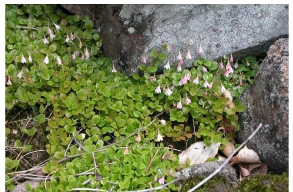
Twin flower, a northern wildflower, will likely be extirpated from Connecticut as temperatures warm.

these habitats support. Invasive species, nonnative or exotic plants and animals have the potential to significantly impact New England's native and most delicate flora and fauna as the climate is altered. Fragmentation of habitat, changes in biological timing known as phenology, and other disruptions to the food web are all threats to biodiversity. Climate change is expected to increase the rate of extirpations of rare and endangered species by altering their habitat.