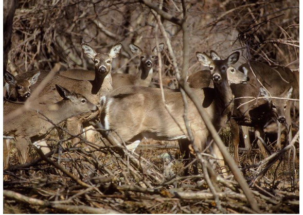
Overabundant deer

colonize and overtake an ecosystem. In the case of deer, regulated hunting seasons are the only practical method of balancing populations of this species with ecological tolerances.