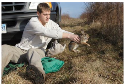
Research on New England cottontails

distribution of plants and animals in the Northeast. This landscape level approach will allow Connecticut to identify vulnerable habitats and wildlife species and project where these habitats and species may be sustained into the future, regardless of political boundaries. Certain states will assume responsibility for vulnerable species if they possess current and future habitat for them. For example, the New England cottontail may be viewed as a "responsibility species" for Connecticut since our state appears to have the best remaining populations of this species.