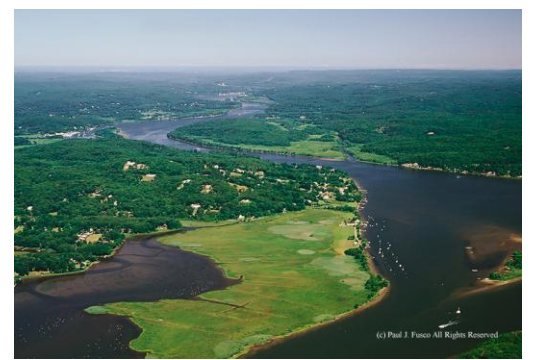
Connecticut River Valley

Drought – In addition to more intense storms and related flooding, more frequent or longer dry spells are also projected in many climate change scenarios. Changes in depth and duration of snow pack, and reductions in infiltration capacity may ultimately alter recharge of groundwater, which affects water supplies. Poor land use decisions, including increases in impervious cover and higher peak runoff contributing to groundwater not being recharged, could have long term water resource ramifications.