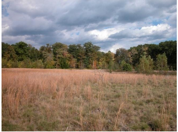
Warm season grasslands are now confined primarily to small openings on dry, sandy soils.

foresight and planning within the state to retain adequate open space for this to occur. (See the Wildlife fact sheet for details on the CTDEP's Grassland Habitat Initiative).