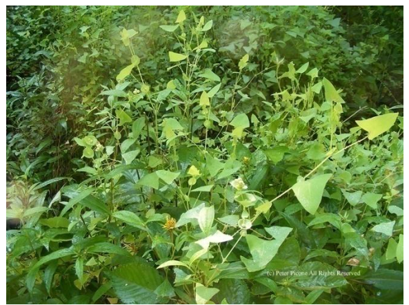
Mile-a-minute; a highly invasive plant newly introduced into Connecticut

In some instances, invasive plants, introduced by human activities and lacking natural controls, take advantage of the disturbances created by these stressors. Invasive species displace native species, change pollination relationships, and alter soil conditions. The Connecticut landscape is over-run with invasive plants such as garlic mustard, black swallow-wort, mile-a-minute and Japanese stiltgrass. Once established, many of these plants release chemicals into the soil, inhibiting the growth of native species, and allowing invasive plants to dominate the understory. Invasive plants do not provide food sources for wildlife and often form a monoculture that reduces the biodiversity of the forests. Numerous other invasive species that occur in warmer climates do not yet occur in Connecticut due to winter temperatures. With milder winters projected, many of these species could establish a foothold adding to the disruption of natural ecosystem function.