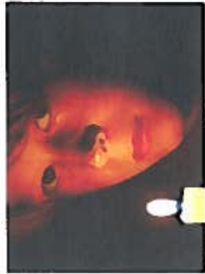
Parents can be held liable for damages caused by their child's fire-setting.

Many children do not understand the legal consequences of setting fires. In fact, you may also be unaware of the criminal charges your son or daughter may face if they set a fire. In some cases, you may also be held financially responsible for your child's behavior.