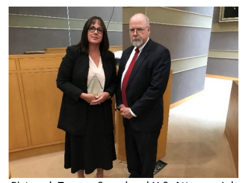
Pictured: Tammy Sneed and U.S. Attorney John H. Durham

The United States Attorney's Office for the District of Connecticut hosted its annual United States Attorney's Office Law Enforcement Awards Ceremony on June 20 in New Haven. The ceremony at the City of New Haven's aldermanic chambers recognized more than 160 individuals for their investigative efforts and other contributions to 31 significant federal criminal prosecutions and civil cases in Connecticut. Approximately 60 of the award recipients are members of local police departments from across Connecticut.