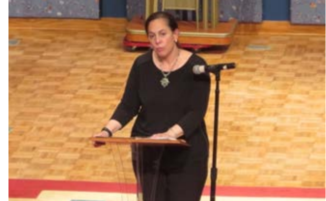
DCF Commissioner Joette Katz