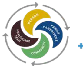
Community-based care coordination through expanded care team