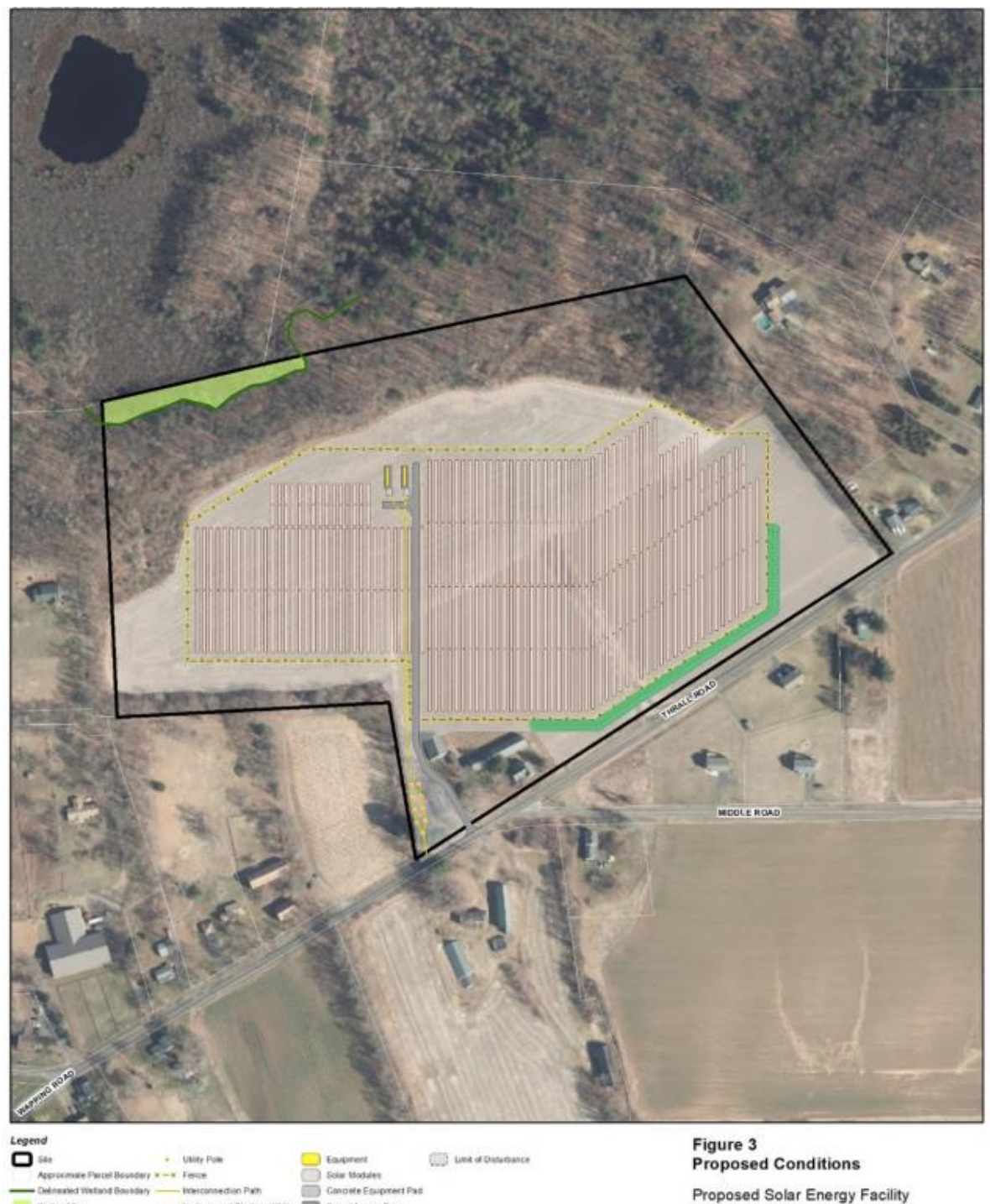
Figure 3 – Proposed Facility Conditions

Proposed Solar Energy Facility East Windsor Solar Two 31 Thrall Road East Windsor, Connecticut