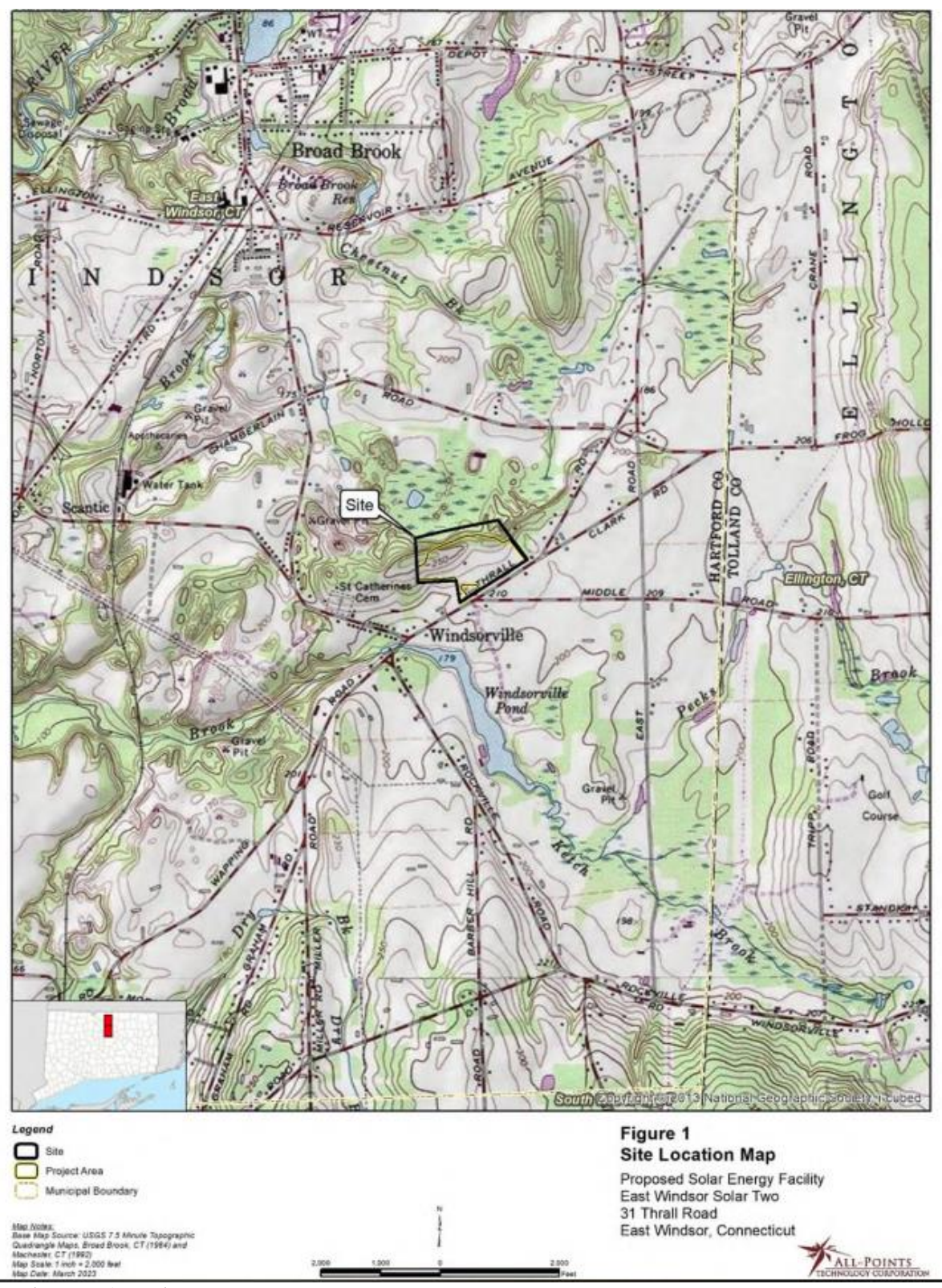
(EWST 1, p. 5)