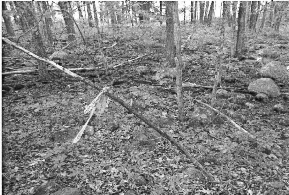
Photo #3 - Easterly View of Main Pooling Area in Center of Wetland on May 24, 2019

The above photo taken in early May of 2019 shows the absence of any pooling water within the largest and deepest of the surface water pooling areas.