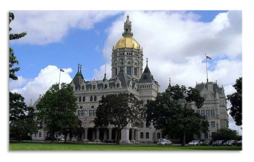
State of Connecticut Criminal Justice Information System