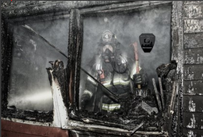
10/08/19 Fitchburg, MA 141 Depot St. dwelling fire