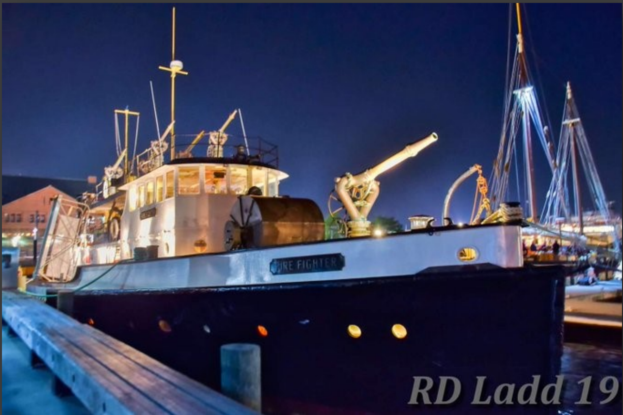
The former FDNY fireboat Firefighter as seen docked in New London, CT Rob Ladd

An International Fire Buff Associates Region 1 Club