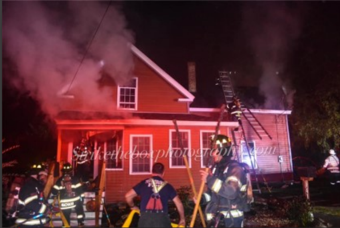
10/08/19 Fitchburg, MA 141 Depot St. dwelling fire