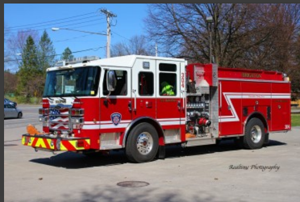
Mike Leary Hilltop FD SC Engine 3 2012 Pierce