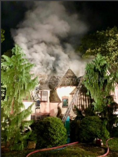
10/03/19 Ossining, NY 107 Revolutionary Rd. dwelling fire—