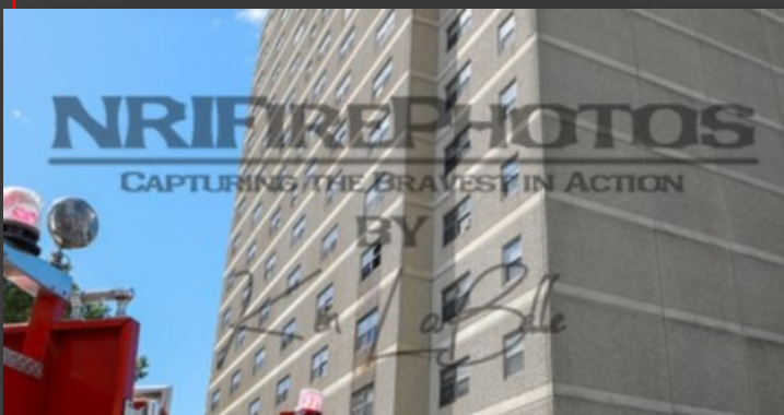
10/04/19 2nd alarm Providence, RI 243 Smith St. high rise apt. fire