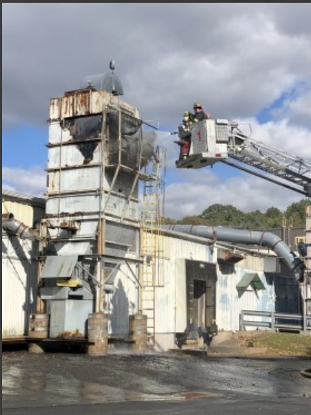
10/04/19 Manchester, CT 24 Mill St. industrial hopper fire —Companies arrived to fire showing from an industrial hopper to the rear of the build- ing. Mutual aid assisted at the scene and for cover- age.