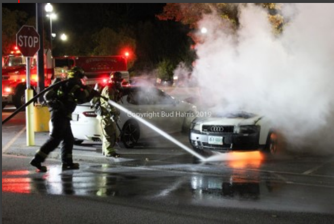
10/08/19 Sturbridge, MA Rt. 20 Applebee's auto fire