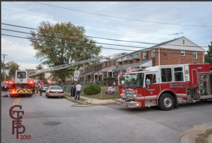
10/19/19 Baltimore, MD 2921 Georgetown Rd X Inverness dwelling fire