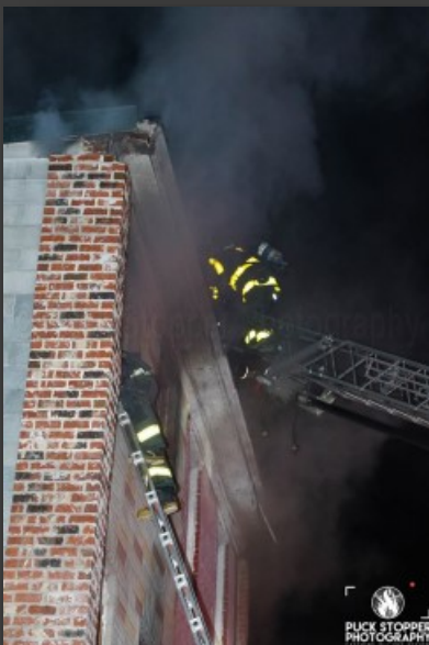
10/20/19 Baltimore, MD 1909 Mc Henry vacant dwelling fire—