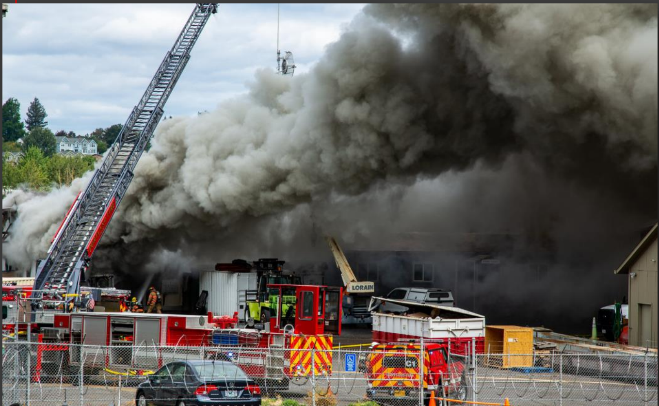
Three alarm commercial fire at 8010 N.W. St Helens Road, Portland, OR

An International Fire Buff Associates Region 1 Club