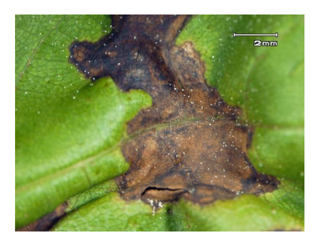
Figure 2. Close-up of anthracnose lesion.

These symptoms are often confused with drought and heat stress since they are very similar. Significant leaf drop and premature defoliation can occur. Samaras can also develop necrotic or dead spots and drop prematurely.