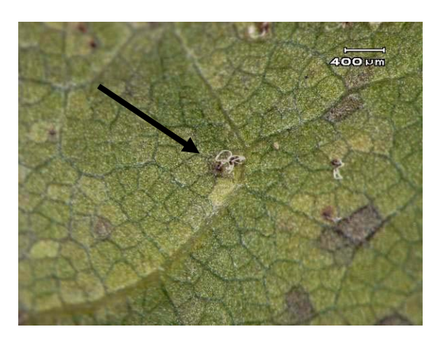
Figure 4. Close-up of tendril of oozing fungal spores (arrow) on abaxial surface of a leaf.

• Tar Spot: Symptoms first appear as inconspicuous, pale green to yellow