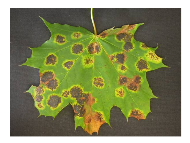
Figure 5. Tar spot on maple.

areas on the leaves. As the fungus grows within the leaf, these areas develop into distinctive, slightly raised, shiny, tar-like, black spots on the leaves (Figure 5). The size of the spot depends upon the fungal species; spots can be irregular and up to ½ inch in diameter ( R. acerinum ) or can appear as tiny, pinpoint dots ( R. punctatum ) (Figure 6). Significant premature fall coloration and defoliation can occur, especially when infection is heavy (as is often the situation on Norway maple).