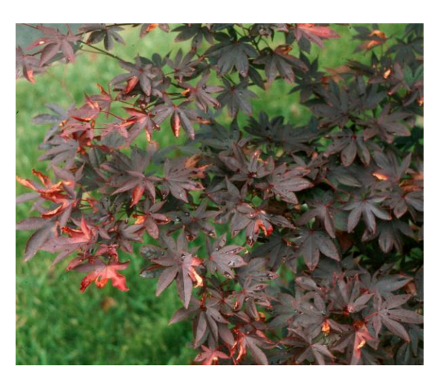
Figure 11. Japanese maple leaves with marginal scorch symptoms

necrotic or dead margins (Figures 11, 12, and 13).