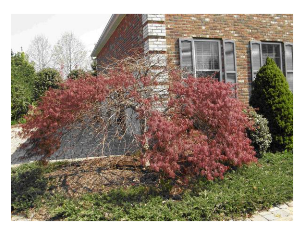
Figure 8. Japanese maple with acute symptoms of Verticillium wilt.

undersized, off-colored leaves. These trees sometimes produce heavy crops of seeds or samaras. A diagnostic characteristic of this disease is a distinctive olive-brown streaking, which may be evident in the wood of symptomatic branches or twigs (Figure 10).