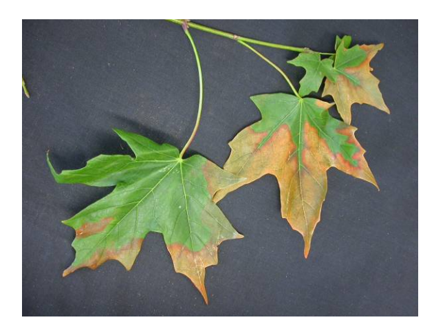
Figure 12. Marginal scorch.