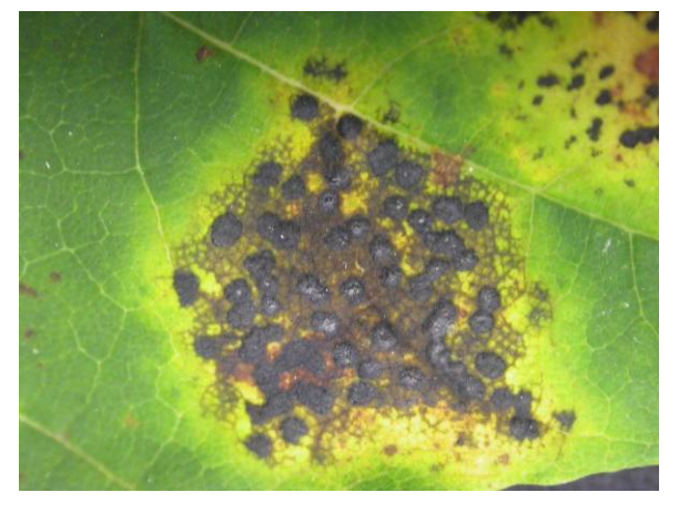
Figure 6. Close-up of the tar-like stroma of the fungus, Rhytisma spp.

Management: Refer to management strategies for foliar diseases at the end of this section.