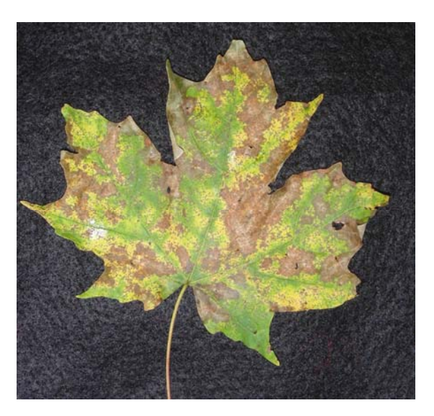
Figure 3. Septoria leaf spot of maple. Initial symptoms are small necrotic spots, which when numerous, can coalesce into large necrotic areas.

Spores of the fungi are often visible as tendrils oozing from the back fruiting bodies after periods of wet weather (Figure 4). These diseases are usually more severe on red, sugar, and silver maple but can occur on Japanese and Norway maple.