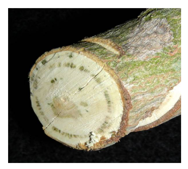
Figure 10. .Diagnostic vascular discoloration in sapwood of maple infected with Verticillium wilt.

Management Strategies for Verticillium Wilt: There are no satisfactory controls for this disease of marks are trees are infected.