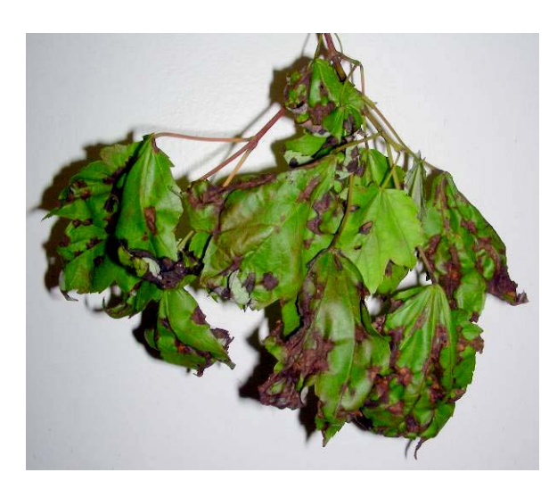
Figure 1. Typical anthracnose lesions delineated by the veination pattern of the leaves.

often apparent from late spring to early summer but additional cycles of disease can result in damage which is visible later in the growing season. The range of symptoms includes leaf spots, blighted leaves and young shoots, cankers, and dieback of young twigs and branches. The most common symptoms are large, irregular dead areas on the leaf that are often V-shaped or delineated by the veins (Figures 1 and 2).