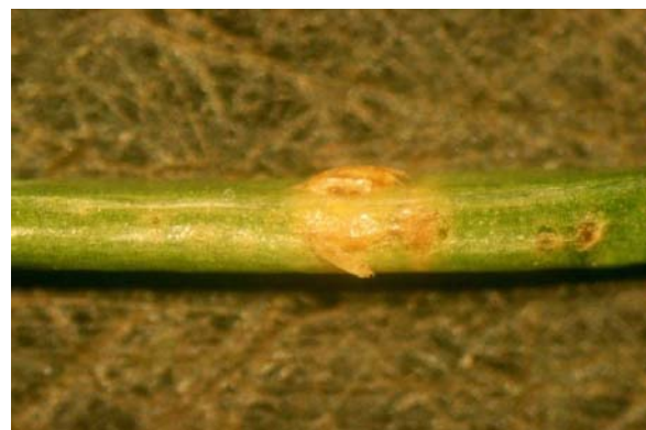
Figure 4. Close-up of rust pustules.