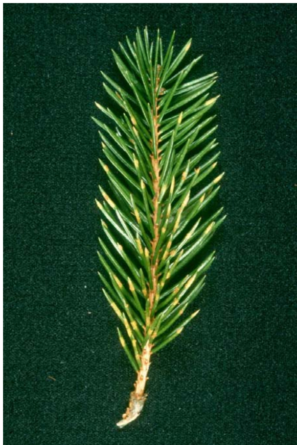
Figure 1. Yellow spots or flecks develop on needles in late winter and early spring.

yellow spots and blisters develop on the infected needles and the disease cycle starts again. Blisters of C. weirii can appear on both 1 st and 2 nd year needles and heavily infected trees can appear distinctively yellow-orange from a distance. Accurate diagnosis requires microscopic examination since symptoms may easily be confused with those caused by other needle rusts. As with most diseases that are not fatal but result in needle drop, repeated defoliation may retard growth and reduce marketability.