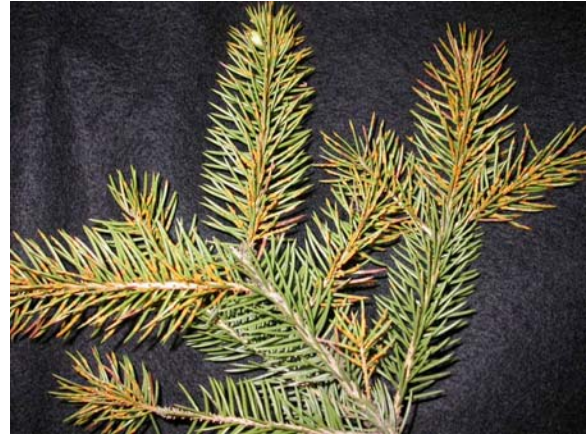
Figure 2. Diagnostic rust symptoms on one-year needles in spring, before new growth has emerged.