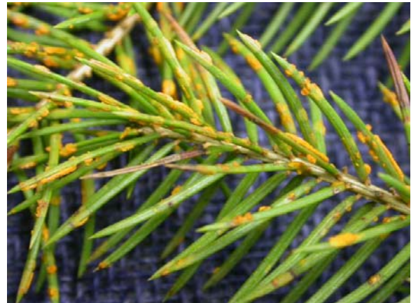
Figure 3. Rust spores blown by wind and splashed by rain onto newly emerging needles.