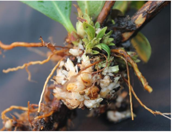
Figure 3. Nodules later develop into a mass of tiny floret-like shoots. Those above the soil line turn green and leaf out. This plant was photographed about two years after planting.