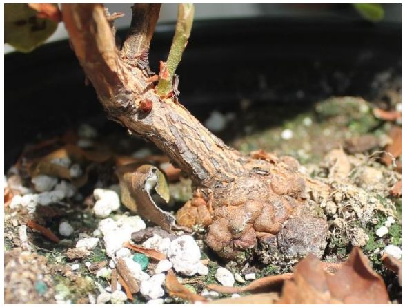
Figure 2. If no shoots are visible, Tissue Proliferation can appear as a gall at the crown of potted plants. However, this is not true crown gall disease and is not caused by bacteria.