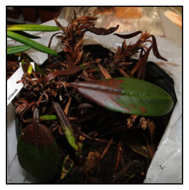
Figure 1. A mail-ordered Rhododendron pronum plant, infected with Phytophthora ramorum . This plant was identified as the result of a USDA-APHIS "trace forward" protocol in 2011.

Connecticut has participated annually to date. As a result of these surveys, nursery plants in Connecticut that had been shipped from west coast nurseries have been confirmed to be positive for P. ramorum in 2004 and 2006. In 2011, a positive rhododendron from an Oregon mail-order company was traced to a residential landscape in Connecticut, marking the first time for the state, and for the northeast, that this pathogen was detected outside of a nursery (Figure 1). It is important to note that positive finds are always followed by thorough and rigorous eradication procedures as mandated by USDA-APHIS-PPO.