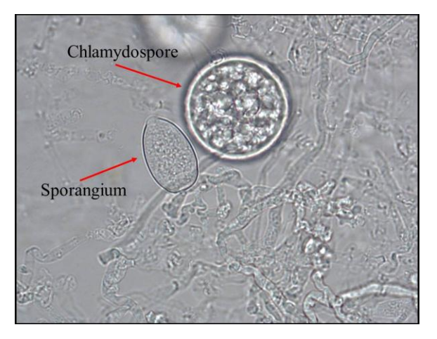
Figure 2. Microscopic view of two types of asexual spores produced by Phytophthora ramorum .

P. ramorum is unique among other species in the Phytophthora genus in that it can infect hosts both through aerial dispersal as well as through soil and water. Extensive studies in California, Oregon, and the U.K. have shown that P. ramorum can spread through movement of infected plant material, irrigation water, and soil. The pathogen is only known to reproduce asexually, but it does so with two very different types of asexual spores (Figure 2).