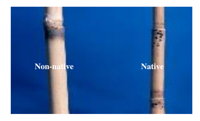
Figure 5: Fungal spots in non-native (absent) and native (present) Phragmites .