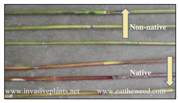
Figure 4: Stem color of non-native and native Phragmites .

studded with black spots caused by a native fungus (Figure 5).