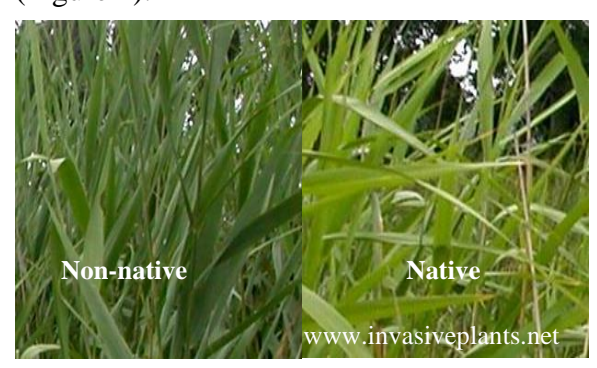
Figure 1: Variation in plant color of non-native and native Phragmites

Invasive Phragmites plants can attain a height of 6 meters or higher and have dark or bluish green leaves while the native Phragmites plants are typically 2 meters tall or less and have yellowish green leaves (Figure 1).