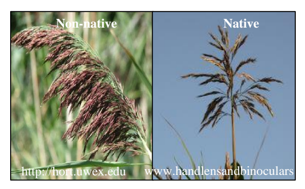
Figure 7: Inflorescence of a non-native and native Phragmites .

The seedhead of Phragmites is called a panicle, which is more compact and longer in invasive Phragmites while it is more open and smaller in the case of native Phragmites . Panicles are multi-branched, and each branch bears multiple spikelets ( Fig 7 ). Each spikelet contains several florets. At the base of each spikelet are two bracket-like structures called glumes.