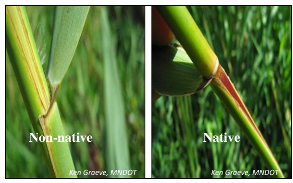
Figure 2: Leaf sheaths of non-native and native Phragmites .

Leaf sheaths of invasive Phragmites remain tightly attached to the stems whereas the leaf sheaths of native Phragmites are loosely attached and the lower leaf sheaths fall off naturally resulting in stripped stems (Figure 2).