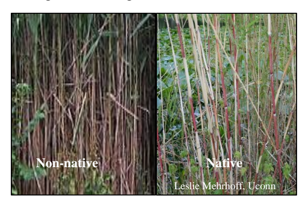
Figure 3: Stem density of non-native and native Phragmites .

Invasive Phragmites have a high stem density resulting in dense, impenetrable, monotypic stands that often block the shoreline view. Native Phragmites have sparsely scattered stems producing thin seethrough stands (Figure 3).