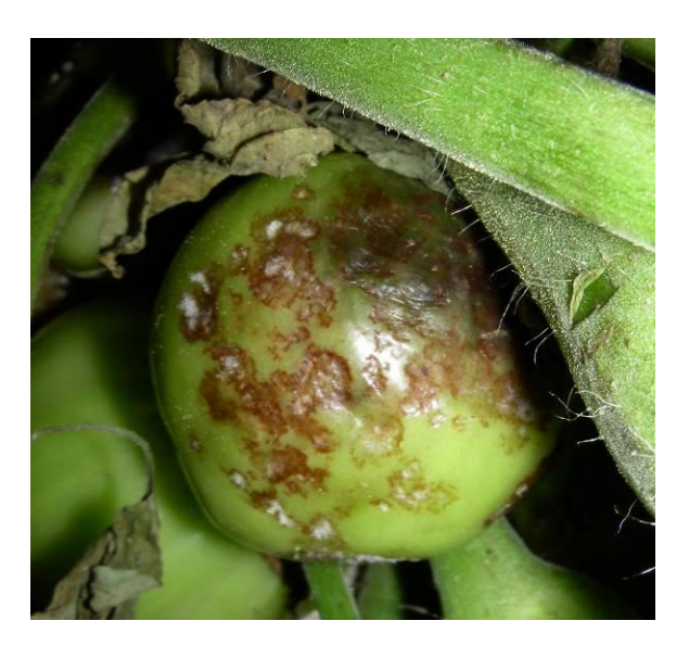
Figure 8. Dark brown, sunken late blight lesions on green fruit.

White, fluffy growth of the pathogen develops on infected fruit during periods of high humidity or moisture (Figure 9). This growth comprises thousands of sporangia of P. infestans (Figure 10).