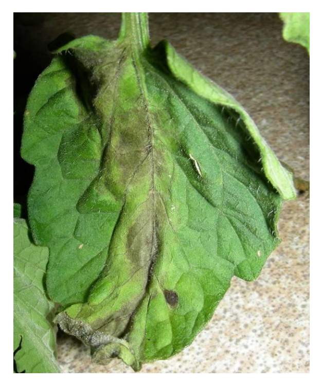
Figure 4. Typical olive-brown late blight lesions on tomato leaflet.

Symptoms commonly develop on leaves, but can occur on petioles, stems, and calyx tissues (Figure 5). After rainfall or heavy dew, white growth of the pathogen is visible on infected stem tissues or on the top or bottom leaf surfaces (Figure 6). When these lesions dry out, the white growth disappears and lesions may appear lime-green or ash-