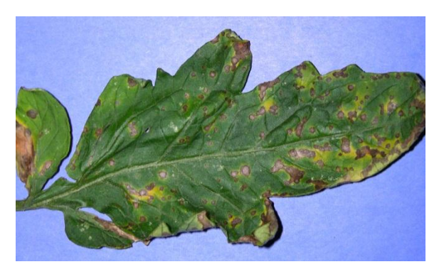
Figure 12. Symptoms of Septoria leaf spot of tomato

Symptoms of Septoria leaf spot usually develop on lower leaves first and appear as small, water-soaked, circular spots 1/16 to 1/8" in diameter that gradually turn gray to tan and have dark brown margins (Figure 12). Infected leaves often turn yellow. In addition, dark brown, pimple-like fruiting bodies of the fungus are readily visible in the tan centers of the spots. Once there are many lesions on the leaflets, the lesions coalesce and form large brown blotches than can be identified as late blight or early blight Figure 13).