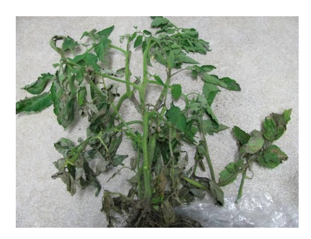
Figure 1. General symptoms of collapse on tomato associated with late blight.

The late blight pathogen can attack all above ground parts of tomatoes and potatoes, as well as potato tubers. Symptoms on stems and leaves of tomato and potato are very similar (Figure 1). They are readily visible to the naked eye and appear as water-soaked olive-brown to black blotches or lesions on leaves and stems. Stem lesions are dark brown, dry, and superficial. They can appear as small spots or can be several inches long (Figure 2).