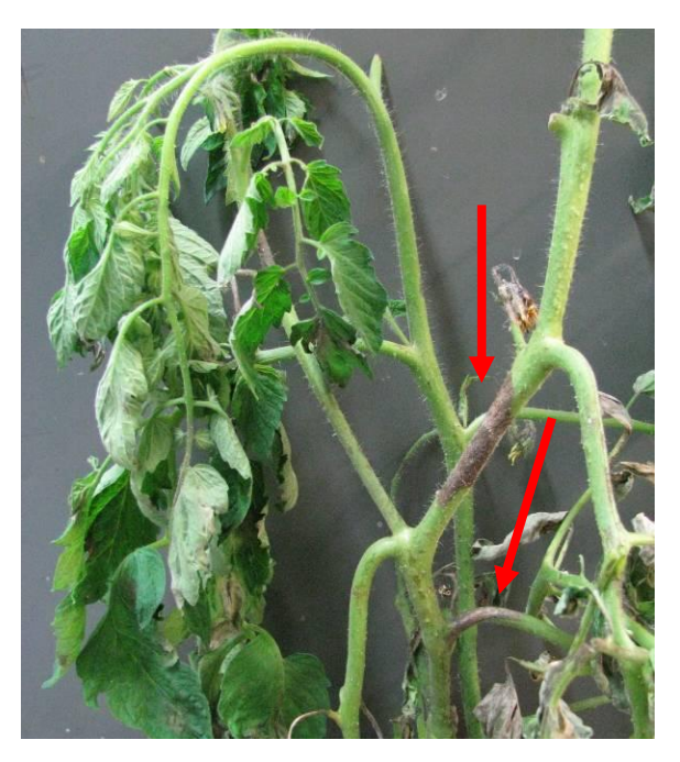
Figure 2. Dry, brown lesions on stems (arrows).

On leaflets and leaves, late blight lesions vary in size from ½ to ¾ inch or larger. Lesions are water-soaked, olive brown, and sometimes have yellow margins (Figures 3 and 4). When many lesions develop, they coalesce into large, brown areas. These infected tissues dry out and shrivel.