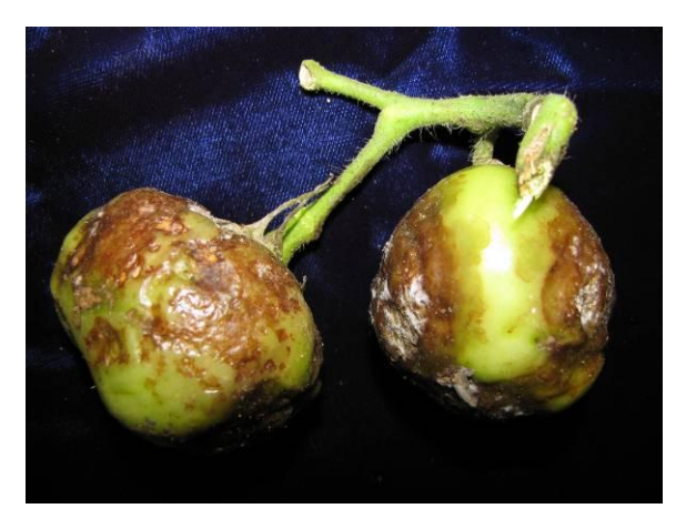
Figure 7. Green tomato fruit with symptoms of late blight.