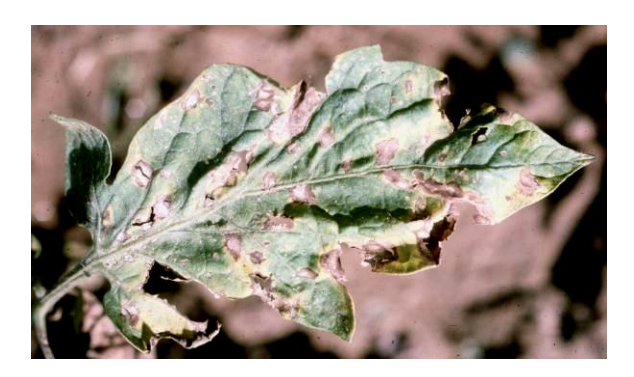
Figure 11. Symptoms of early blight caused by Alternara solani .

solani. Both of these fungal diseases are more common in Connecticut than late blight and can be differentiated bv microscopic identification and by macroscopic features. Early blight symptoms can develop on any aboveground plant tissues. Initial symptoms are dark brown to black, dead spots that range from a pinpoint to ½" in diameter. As the spots enlarge, diagnostic concentric rings may form as a result of irregular growth patterns by the organism in the leaf tissue. This gives the lesion a characteristic "target-spot" or "bull's eye" appearance (Figure 11).