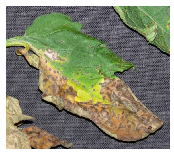
Figure 13. As the spots age, they sometimes enlarge and often coalesce to form brown blotches on the leaflets.