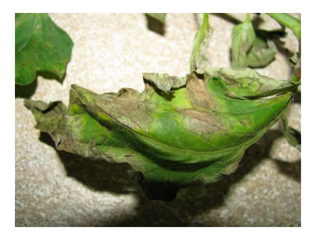
Figure 3. Early symptoms of late blight appear as brown, water-soaked lesions with yellow margins.