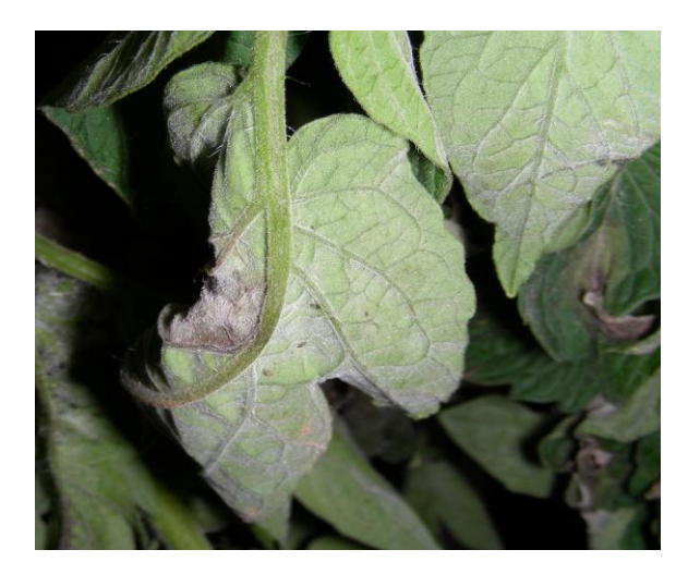
Figure 6. White sporulation of the pathogen on the undersurface of infected leaflets.