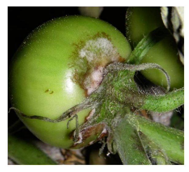
Figure 9. White sporulation of the pathogen on the surface of an infected fruit.

Potato tubers are infected in the field when sporangia are washed from the foliage the soil. Infections generally begin in cracks,