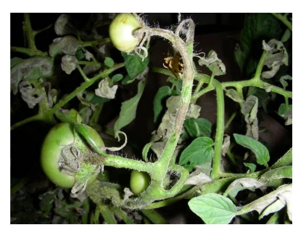
Figure 5. Late blight lesions on fruit calyx and stem tissues.

gray in color. Symptoms rapidly develop on leaflets, leaves, and stems when weather is favorable for infection and spread, so plants can be killed in several days.