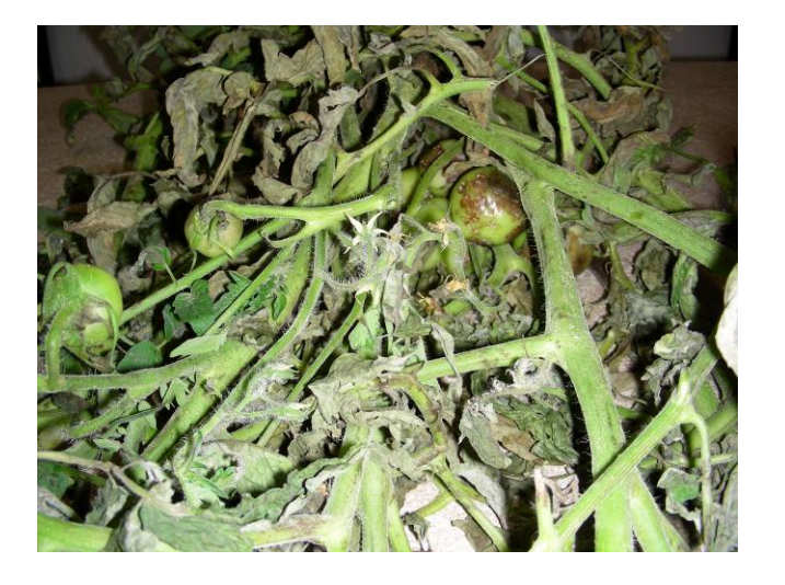
Collapsed tomato plant with fruit and leaf symptoms.