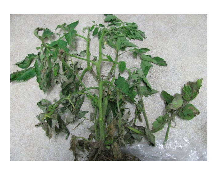
IMAGE GALLERY (Companion to Fact Sheet LATE BLIGHT OF TOMATO AND POTATO IN CONNECTICUT—2009)

Tomato plant with symptoms of late blight. All above ground portions of a plant can be infected.