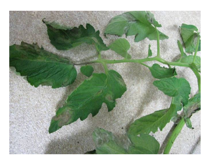
Early symptoms of late blight develop on leaflets. They appear as ½-inch brown blotches.