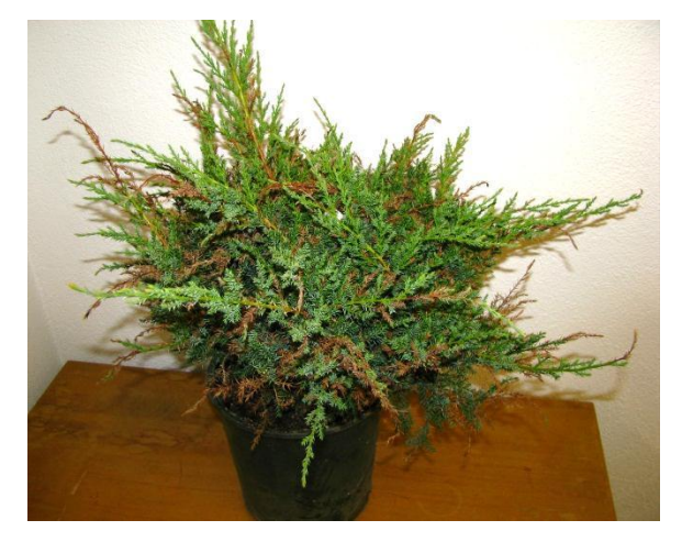
Figure 1. Tip blight on juniper—note random distribution of symptoms within the canopy.

Phomopsis tip blight , caused by the fungus Phomopsis juniperovora , generally infects healthy, newly developing, immature needles and shoots in spring. However, the