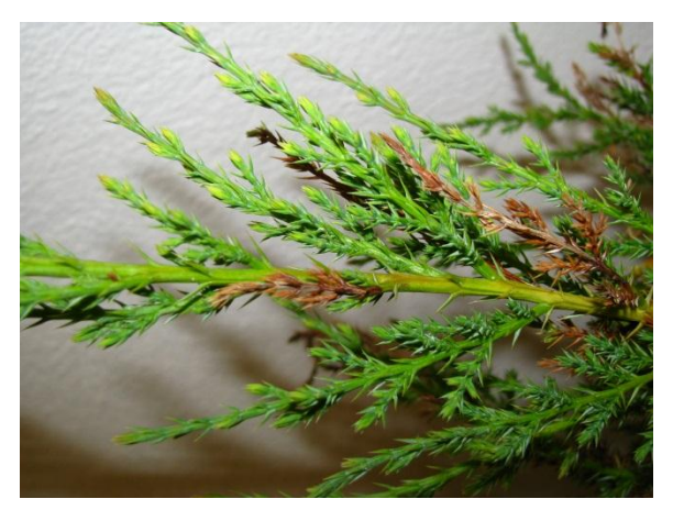
Figure 2. Young, succulent shoots are infected in spring.

gradually move into the stem. Eventually the entire branch may die. Repeated infections can occur during cool, wet periods in spring or fall. Symptoms of Phomopsis tip blight are usually visible by midsummer.