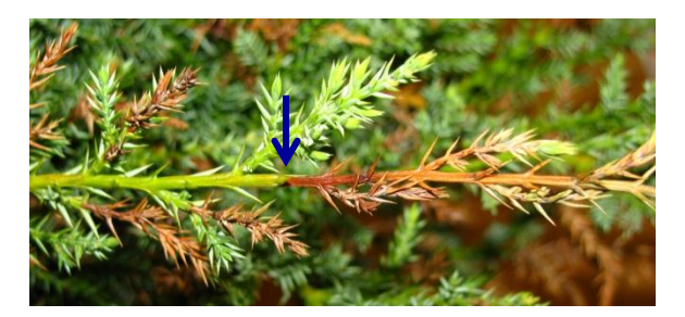
Figure 3. As the infection expands, tips develop a blighted appearance. Note the transition from infected to healthy tissue (arrow).

Kabatina tip blight is caused by the fungus Kabatina juniperi. The symptoms are very similar to those associated with Phomopsis. Kabatina usually infects However, wounded, one year or older twigs and does not infect healthy tissues. Infections are associated with injuries from pruning, insect activities, or severe winter weather. Infections usually occur in the fall, so symptoms of Kabatina tip blight generally show up when foliage begins to regain its seasonal color in early spring (March or