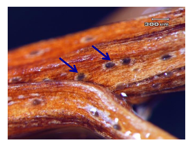
Figure 4. Phomopsis fruiting bodies (pycnidia) (arrows) on symptomatic shoots.

Phomopsis and Kabatina overwinter in fruiting structures on infected twigs or in plant debris on the ground. In later stages of disease development, small, dark fruiting bodies can be found on blighted needles and twigs. Phomopsis fruiting bodies (pycnidia) produce spores throughout the season during wet, cool weather. However, spring and fall infections are most common (Figure 4). In contrast, Kabatina fruiting bodies (acervuli) produce spores in fall, when most infections occur (Figure 5). Spores of both fungi are spread by splashing or wind-driven rain.