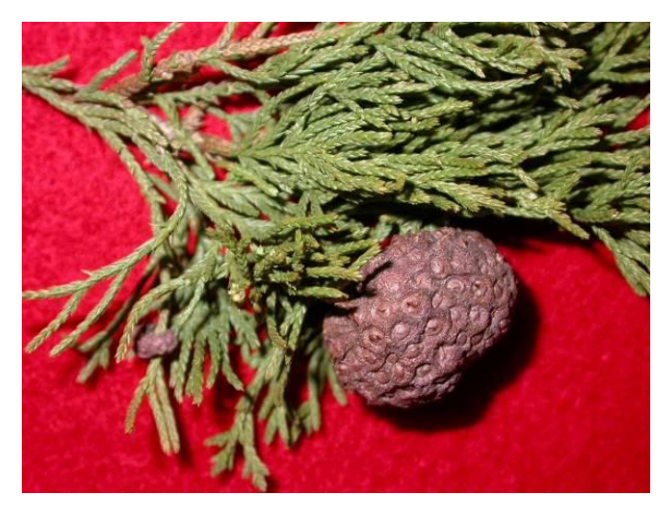
Figure 6. Dormant cedar-apple rust gall overwintering on Eastern red cedar.