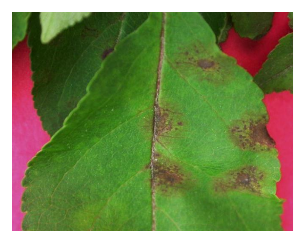
Figure 1. Olive-black, velvety scab lesions with feathery margins.

Scab, sometimes referred to as "apple scab," is the most noteworthy and common disease of crabapple in Connecticut. It is usually most severe after cool, wet spring weather. Leaf symptoms are first visible in May or early June and appear as pale green blotches. These develop into circular, olive-black, velvety lesions with feathery margins that are diagnostic for this disease (Figure 1). These lesions are often found along the mid-