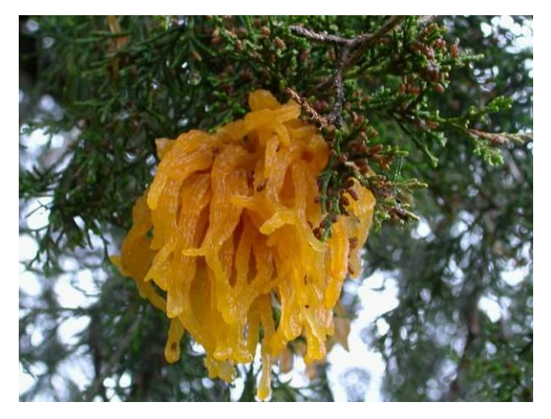
Figure 7. Spectacular, gelatinous telial horns develop from galls after rain.