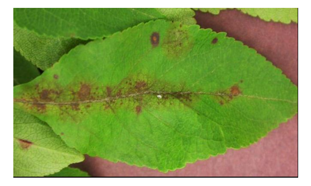
Figure 2. Scab lesions concentrated along the midvein of a leaf.

vein (Figure 2) where the leaf surfaces stay wet for longer periods of time. Infected leaves usually turn yellow or chlorotic, even when they only have a few spots. As the