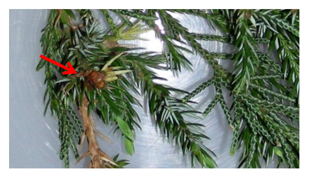
Figure 10. Dormant cedar-hawthorn gall (arrow) on juniper.