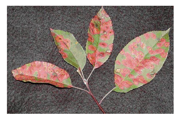
Figure 3. Symptoms of cedar-apple rust on redpigmented crabapple (upper leaf surface).

the wind to crabapple trees where they infect and produce characteristic lesions on newly developing crabapple leaves.