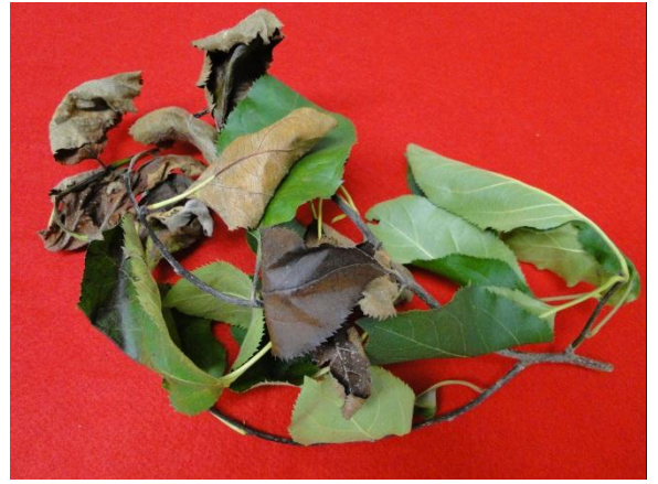
Figure 12. Blackened leaves remain attached to infected shoots.

blight is the bending of the "blighted" terminal, which resembles a shepherd's crook.