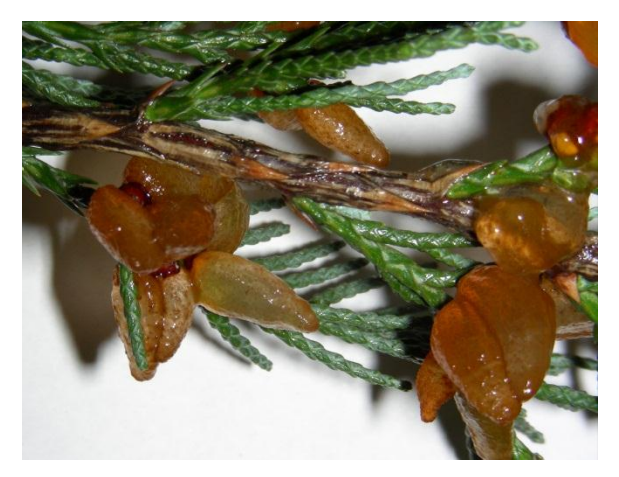
Figure 11. Telial horns protruding from cedar-hawthorn galls in spring.