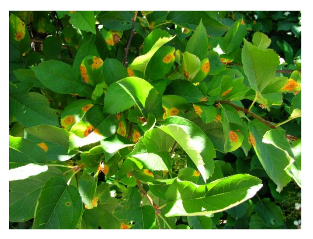
Figure 8. Brightly colored cedar-hawthorn rust lesions on crabapple.

Symptoms usually develop on leaves but cedar-hawthorn infections can also result in symptoms on fruit, petioles, and twigs. On leaves, characteristically brightly colored lesions develop in June and July (Figure 8). Cedar-hawthorn rust can be distinguished from cedar-apple rust by several attributes of the fungal fruiting structures (aecia) on the undersurface of the leaves of crabapple. For example, the aecia of cedar-hawthorn rust are substantially longer than those of cedarapple rust and appear as finger-like