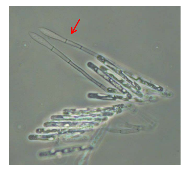
Figure 18. Photomicrograph of distinctive protruding vesicles (arrow) and cylindrical spores.

The boxwood blight pathogen has a rapid disease cycle that can be completed in one week. It has a temperature range of 41-86 °F. The optimum temperature for growth is 77 °F. The fungus is sensitive to high temperatures and is killed after 7 days at 91 °F. Infections can occur very quickly under warm (64-77 °F), humid conditions.