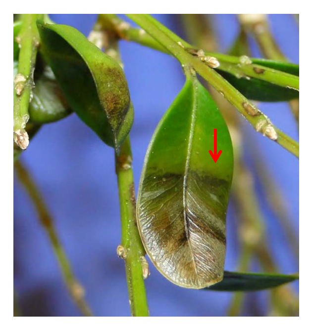
Figure 3. Blighting of leaves. Lesions often have a concentric pattern or a "zonate" appearance (arrow).