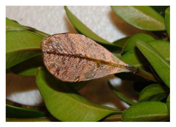
Figure 20. Diagnostic, salmon-colored fruiting bodies of Volutella blight.

(Figure 21). This disease can result in extensive leaf drop.