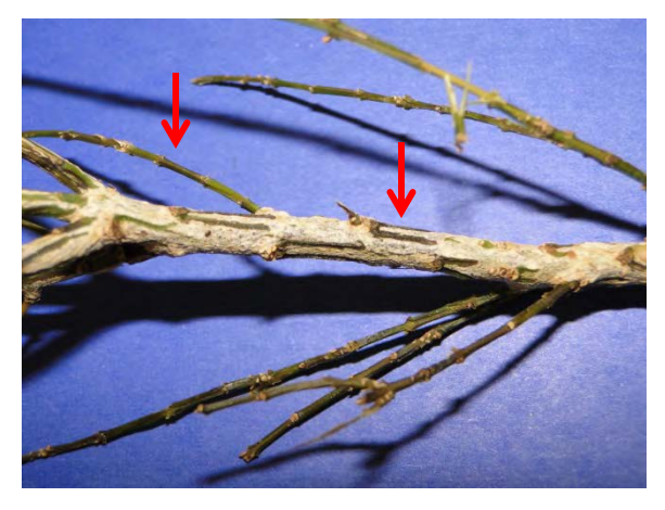
Figure 4. Diagnostic young, developing black cankers on stems (arrows).