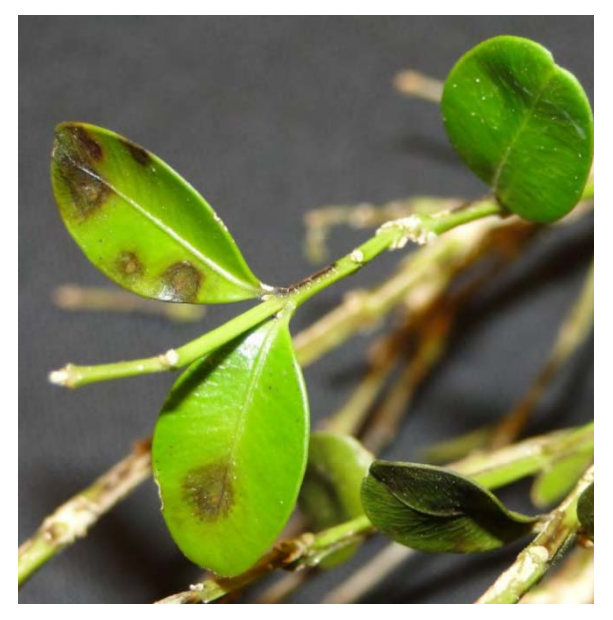
Figure 2. Initial symptoms appear as dark or light brown spots on the leaves.

attempts to regrow, repeated infection and defoliation can weaken the root system and lead to plant death, especially for young plants or new transplants.