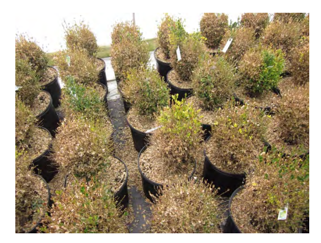
Figure 9. Boxwood blight symptoms in container-grown plants. Note extensive leaf debris in the pots and on landscape fabric.