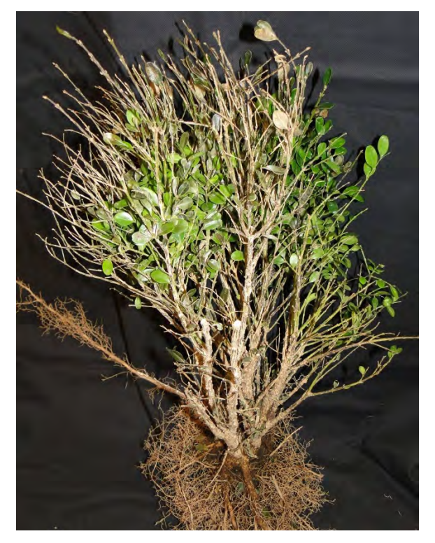
Figure 1. Symptoms of boxwood blight on a boxwood from a landscape planting.

In October 2011, samples of boxwoods with unusual symptoms were submitted to The Plant Disease Information Office of the Experiment Station for diagnosis. Symptoms included leaf spots and blights, rapid defoliation, distinctive black cankers on stems, and severe dieback (Figure 1).