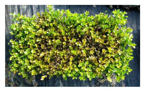
Figure 10. Boxwood blight symptoms in a propagation flat.