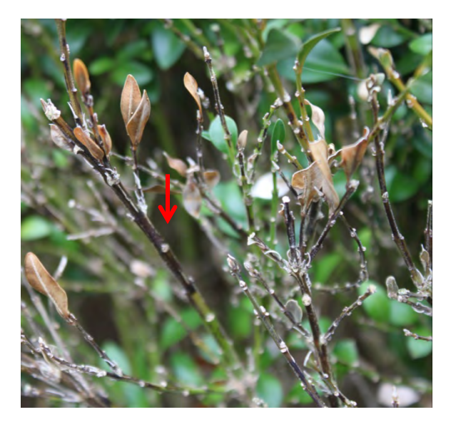
Figure 5. Dieback on stems girdled by coalesced, black cankers (arrow).

Boxwood blight can spread very rapidly under warm and humid conditions. For example, in 2011 we have seen several examples of established boxwood plantings in Connecticut landscapes that were apparently killed in one season following the introduction of infected plants—2011 was a particularly cool, wet year that included several violent rain events (Figures 6 and 7).