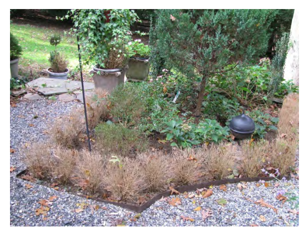
Figure 6. Seven-year-old planting of boxwood infected with blight.