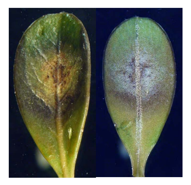
Figure 14. Upper leaf surface with lesion (left) and sporulation on lower leaf surface (right).