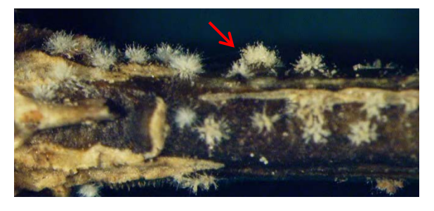
Figure 16. Numerous fruiting bodies (sporodochia, arrow) emerging from black stem cankers.

Infected plant material is the primary means for long-distance spread. The key factor for unintentional spread of this disease is movement of apparently "healthy" boxwoods (infected, but asymptomatic or having very limited outward symptoms) or boxwoods treated with fungicides that suppress, but do not kill or eradicate the fungus, to nurseries and landscapes. This method of disease transmission is often called the "Trojan horse" or "Typhoid Mary" syndrome.