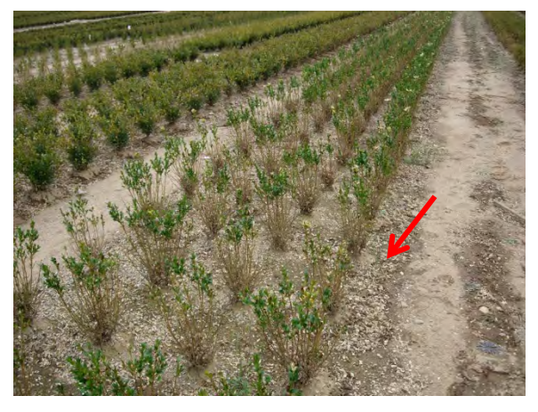
Figure 11. Field-grown boxwood plants with symptoms of boxwood blight (note leaf debris, arrow).