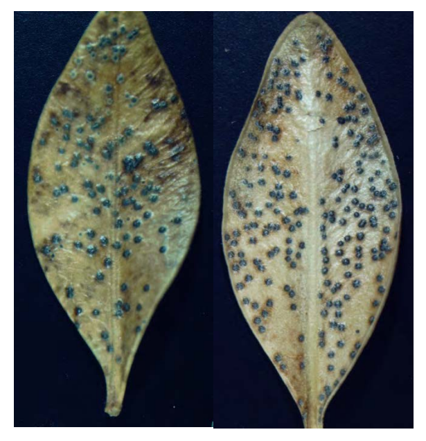
Figure 21. Diagnostic symptoms of Macrophoma leaf spot (left, upper leaf surface, right, lower leaf surface).

Boxwood decline is associated with root damage by root-knot nematodes (Meloidogyne and Pratylenchus) . Plants often undergo progressive decline over a period of several years. Symptoms include stunting, wilting, loss of vigor, and chlorosis. Some bronzing of internal foliage can occur. Depending upon the nematode, root symptoms include formation of swollen