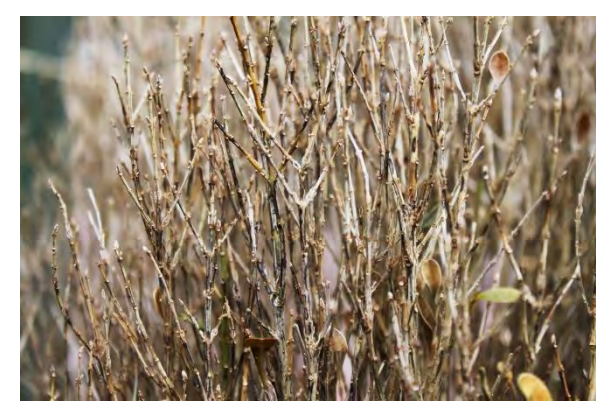
Figure 12. Close-up of dieback and defoliation associated with black stem cankers.

Sporodochia contain large numbers of sticky, cylindrical spores (conidia), which give the sporodochia an angular or crystalline appearance (Figure 17). Structures of the fungus called vesicles form in the sporodochia and protrude from the main fruiting body (Figures 17 and 18). Spores (conidia) are cylindrical and hyaline, and usually have one septation (Figure 19).