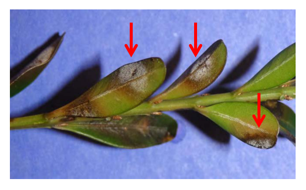
Figure 13. Sporulation of the fungus on undersurfaces of symptomatic leaves (arrows).

Boxwood blight spores are splash-dispersed and can be carried by wind or wind-driven rain over short distances. Longer distance spread is thought to occur through the activities of humans (e.g., contaminated boots, clothing, and equipment), animals, and birds, since the spores are sticky.