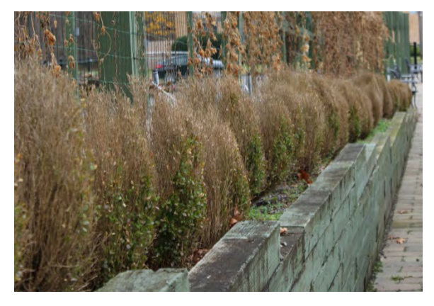
Figure 7. Established planting of boxwood with symptoms of boxwood blight.

Boxwood blight can also be a very serious problem in commercial production settings, because the conditions are highly favorable for infection—many susceptible plants are grown in close proximity in a field or pot-topot in a hoop house, levels of humidity are often high, plants are often watered overhead, and leaf debris is abundant (Figures 8, 9, 10, 11, and 12).