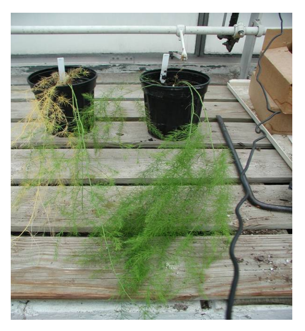
Figure 6. Effect of earthworms on growth of asparagus. The plant on the left was grown without earthworms and the plant on the right had earthworms added to the soil.

Phytophthora spear rot was first described in California in 1938, but has appeared in New England in the last decade. The fungus-like organism associated with the disease is Phytophthora asparagi .