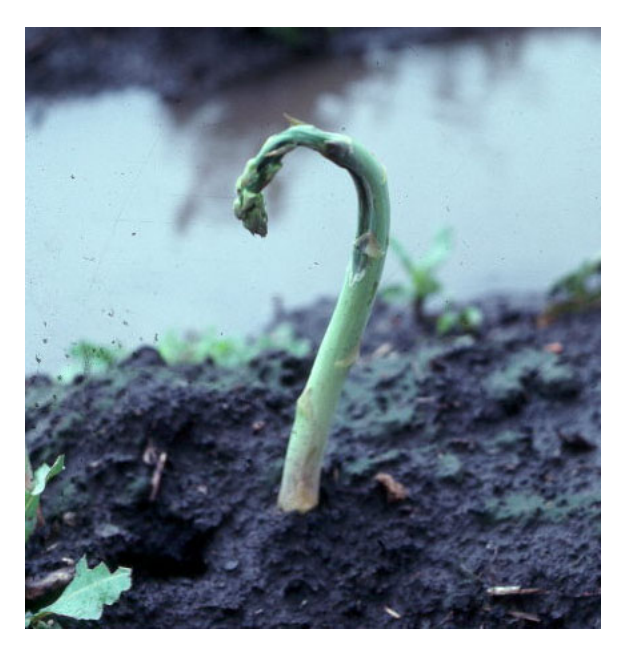
Figure 7. Curling asparagus spear infected with Phytophthora rot.