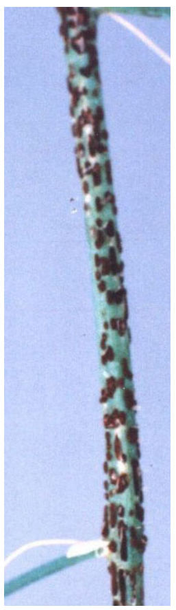
Figure 9. Symptoms of asparagus rust. Lesions of the orange fruiting bodies characteristic of the aecial stage (left) and fruiting bodies of the darker telial stage (right).

Management of rust in the US includes an integrated approach of resistant cultivars, sanitation, and fungicides. Breeders have since made great improvements in