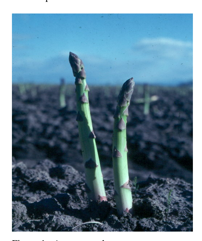
Figure 1. Asparagus shoots.

crop year-round has made serious inroads into US production.