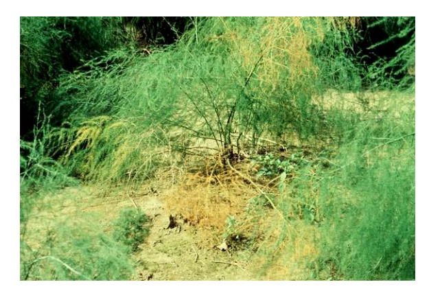
Figure 3. Yellowing and wilt of ferns with Fusarium crown and root rot.

Phytophthora rot. Fusarium crown and root rot was first noted in Massachusetts in 1908 and affects seedlings and mature plants. Symptoms include yellowing of the ferns, occasional wilt, and crown rot (Figures 3 and 4). The Fusarium fungi associated with the disease are Fusarium oxysporum and F. proliferatum . These pathogens are seedborne and are introduced on transplants and may exist at low levels in soil never planted to asparagus. The disease became economically limiting in the 1950's and caused many Connecticut growers to abandon asparagus as a crop.