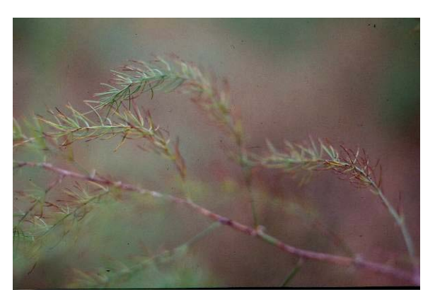
Figure 11. Symptoms of purple spot on ferns.

During a harvest period in Connecticut, spears were free of purple spot until two days of wet and cold weather occurred, and then incidence increased to 100%. When weather conditions improved, new spears remained disease-free. Current management of purple spot has focused on sanitation and fungicides. Removing the previous year's fern growth can reduce severity of purple spot on spears during harvest. Chlorothalonil was effective when applied to the ferns during cool, wet periods.