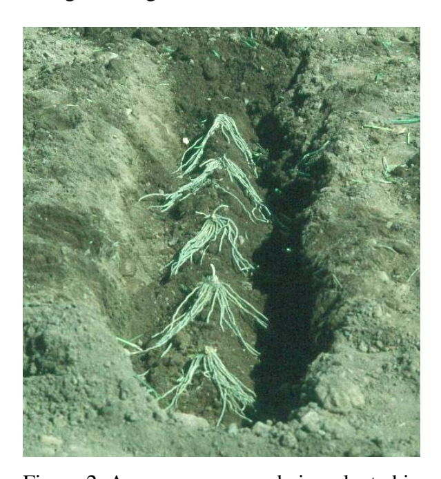
Figure 2. Asparagus crowns being planted in trenches 10 inches deep.

Asparagus is usually established with 1year-old plants, commonly referred to as crowns, which include buds and fleshy storage roots. All-male hybrids (Jersey hybrids) have repeatedly been shown by the author to be superior to open-pollinated cultivars (Mary Washington). Sandy, welldrained soils are best suited for asparagus production. Growers should check soil pH and ensure that pH is between 6.5 and 7.0. Crowns are buried approximately 10 inches deep in trenches in the spring (Figure 2). The first marketable spears are harvested after 2 years, cut to 18-22 cm in length every 24-48 hr. Harvest periods can last up to 2 months in Connecticut, depending on the age and vigor of the field.