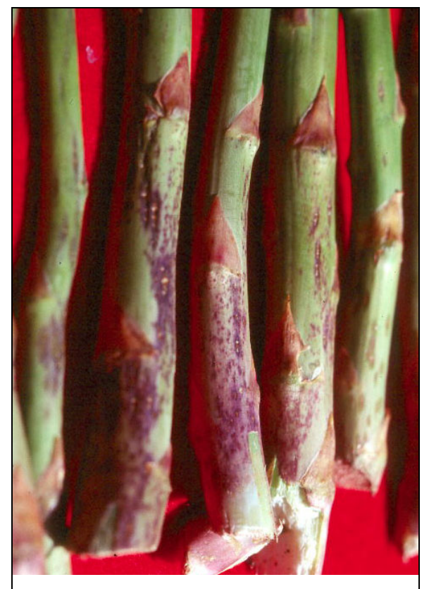
Figure 10. Diagnostic symptoms of purple spot on spears. Spots blemish and reduce the quality of the spears.

Purple spot is caused by the fungus Stemphylium vesicarium , and was first reported in the US in 1981. The disease has since been reported in all major asparagusgrowing regions in the US, including Connecticut. It causes two types of symptoms: on spears and on ferns. On spears, symptoms appear as small (0.02-0.10 in), elliptical, slightly sunken, purplish spots, which blemish the spears and lower marketability (Figure 10).