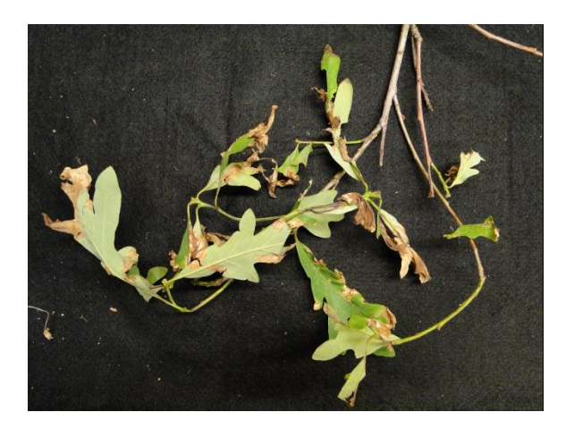
Figure 19. Heavily infected leaves have a blighted appearance.