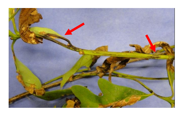
Figure 20. Petiole and stem lesions (arrows) on infected white oak.