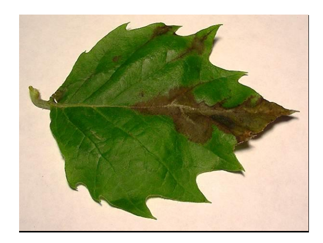
Figure 15. Lesions often enlarge to V-shaped, necrotic areas between veins.