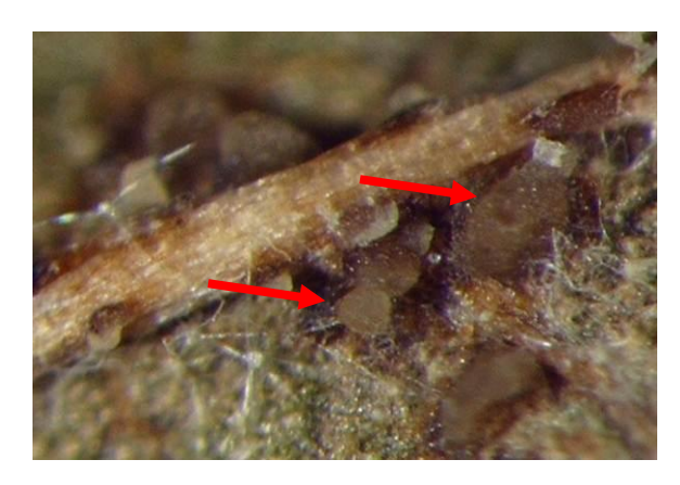
Figure 1. Arrows indicate fruiting structures, called acervuli, that are oozing spores of the sycamore anthracnose fungus.

The term "anthracnose" refers to diseases caused by fungi that produce spores (conidia) in fruiting structures called acervuli (Figures 1 and 2).