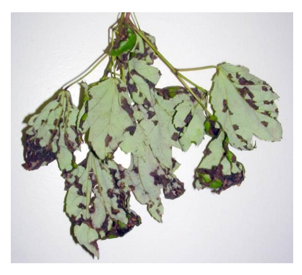
Figure 5. Same leaves as in Figure 4, only this view is of lower leaf surfaces.

These areas can first appear as small spots that eventually enlarge and become V-shaped or delineated or defined by the veins. Affected tissues can be tan to brown and