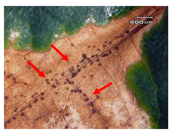
Figure 18. Fruiting bodies (arrows) of the anthracnose fungus along the vein of the lesion in Figure 17.