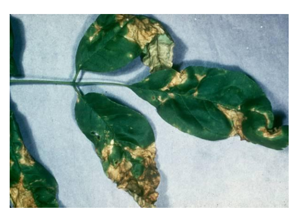
Figure 3. Symptoms of ash anthracnose. Note angular, necrotic lesions on leaflets that distort the overall appearance of the leaf.

Symptoms: Symptoms develop on newly expanding shoots and leaves in spring. Tender shoots are blighted and killed during cool, wet weather. Infections on developing leaves first appear as water-soaked, irregular areas. These develop into brown, somewhat papery lesions (Figure 3). When infections are moderate, only portions of each leaflet are affected.