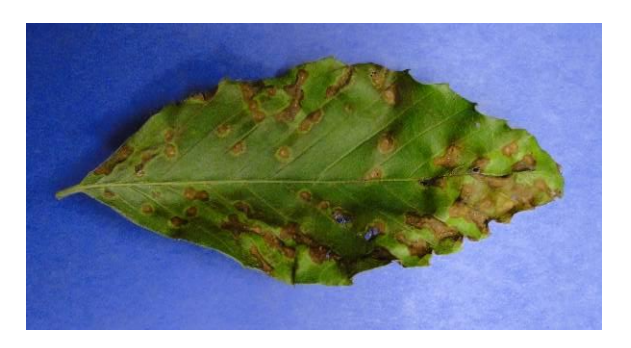
Figure 8. Irregular, brown spots between the veins of beech leaves.

Symptoms: Early symptoms of beech anthracnose appear as irregular, brown spots on the leaves that are usually positioned on or between leaf veins (Figures 8 and 9). As the symptoms progress, the dark brown necrotic tissue expands to all interveinal portions of the leaf (Figure 10) and eventually large sections of the leaf become necrotic (Figure 11). Infected leaves will eventually drop from the tree.