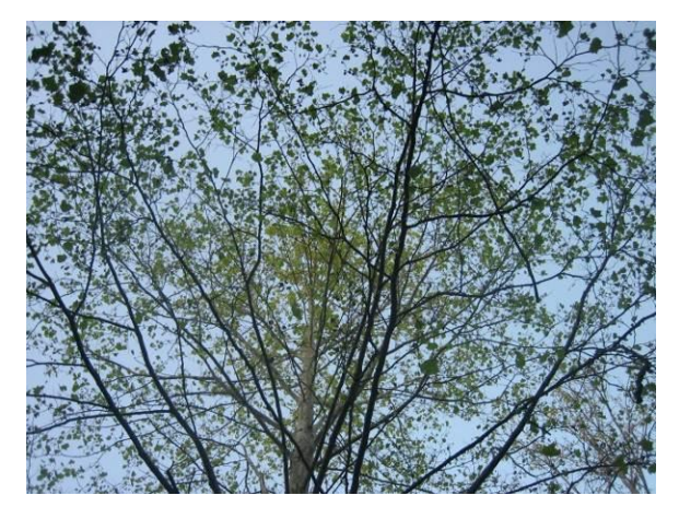
Figure 12. Sycamore infections can be recognized by the sparse canopy, as the tree begins to leaf-out in the spring.

most trees will have re-foliated with a canopy of healthy leaves.