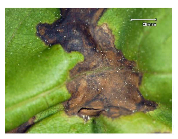
Figure 6. Close-up of maple anthracnose angular lesion.

paper-thin (Figure 6). When infection is severe, the fungus enters the petioles and causes entire leaves to appear blighted, browned, and shriveled. Distorted leaves with maple anthracnose can be confused with frost (Figure 7), drought, and heat stress. Samaras can also develop necrotic or dead spots and drop. Significant leaf drop can occur in late spring but trees usually refoliate by mid-summer.