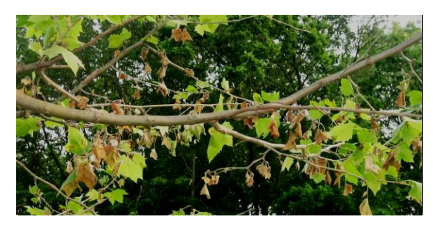
Figure 13. Infected leaves brown and drop prematurely.

most trees will have re-foliated with a canopy of healthy leaves.