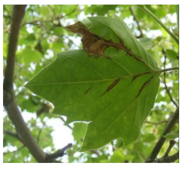
Figure 14. Lesions of sycamore anthracnose first develop along the veins.