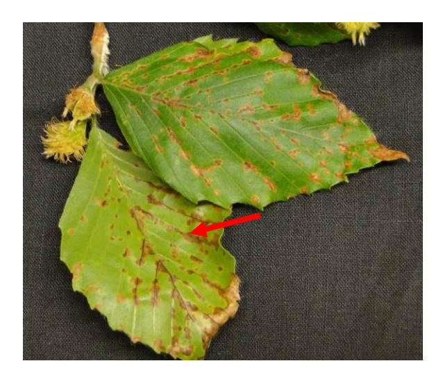
Figure 9. Necrotic lesions along veins of infected leaves (arrow).