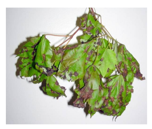
Figure 4. Symptoms of maple anthracnose on upper leaf surfaces.

Norway maples, whereas large, brown patches develop between the veins on sugar maple leaves. Symptoms on Japanese maples appear as light tan, papery spots in the leaf or as tan areas at leaf margins. Although symptoms vary with the type of maple, the symptoms that are common to most maples are irregular, dead areas on the leaves (Figures 4 and 5).