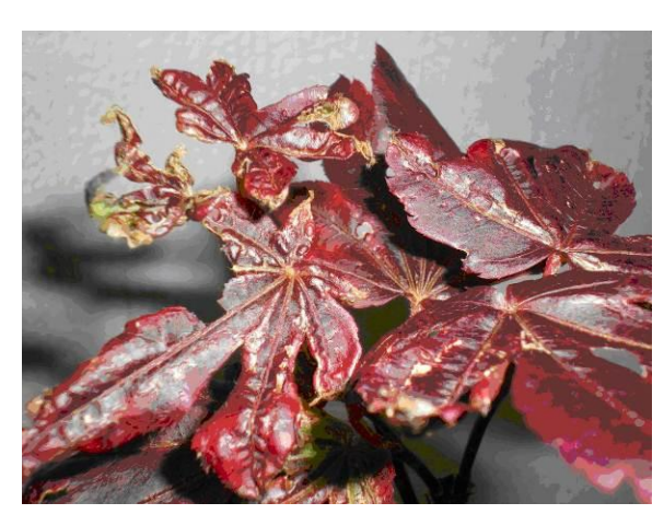
Figure 7. Frost damage to Japanese maple. Note marginal necrosis and distortion of the leaves.