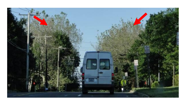
Figure 11. Sycamore trees with anthracnose and sparse canopies (arrows) are easily distinguished from other species of healthy trees with full green canopies in late spring.

In the final leaf blight phase, newly expanding leaves are infected and killed as they emerge (Figure 13). Leaves are most susceptible during the first few weeks of growth. Lesions often first appear along the veins of infected leaves (Figure 14). These areas expand into large, brown areas on the leaves (Figure 15) and into the petioles. Significant leaf drop can occur in late spring or early summer, although by mid-summer,