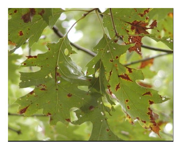
Figure 16. Irregular, necrotic lesions are concentrated along the veins of oak leaves infected with anthracnose.

When the spots are numerous, they coalesce and give the leaves a blighted appearance (Figure 19). Lesions can develop on petioles and green stems as the fungus colonizes these tissues (Figure 20). Heavily infected leaves become distorted and often drop prematurely by late spring or early summer. In most cases, trees are usually refoliated by late summer.