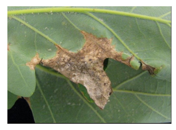
Figure 17. Close-up of necrotic anthracnose lesion on white oak.