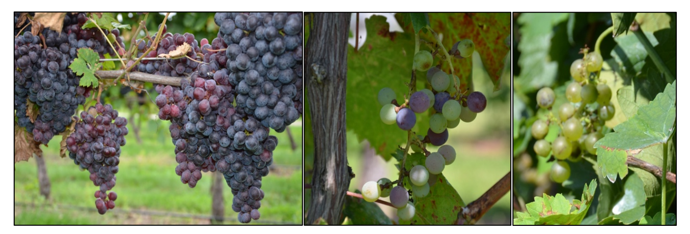
Figure 2. Irregular and delayed fruit ripening, reduced cluster size, loose clumps, and small berries in grapevines with leafroll degeneration/decline disease.

In summary, it is extremely important that all plant rootstocks and scion wood bought from nurseries is healthy and tested free of GLRaVs. Growers should only acquire planting material from virus-tested, clean vine stocks! Since most of these viruses have vectors that are present in Connecticut and can spread to the entire vineyard, control of mealybugs and scale insects together with regular scouting and roguing out diseased vines are recommended measures to reduce the disease spread within a vineyard.