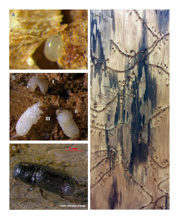
Figure 3. A : Eggs laid in niches along the galleries, B . I, II and III larval stages, which feed in the cambium until they are grown and then excavate areas near the bark surface to pupate. C . Adult beetle. D . SPB galleries, larval chambers and development of blue stain along the inner bark. E . Blue stain in the late wood of red pine ( Pinus resinosa ).

Once the beetles overcome the tree defense responses and bore under the bark, they proceed to feed and reproduce on the phloem, introducing the complex of microorganisms (fungi and bacteria) and mites. As they advance into host tissue, beetles disseminate these microorganisms along with a pathogenic<sup>1</sup> fungus (blue stain). At the same time, female beetles deposit numerous eggs along the sides of the galleries (tunnels in the inner bark). Larva feed outward into the phloem; completing their development inside the tree (Fig. 3A-D). To increase the probability of beetle population survival, female beetles exit the host and attack a nearby tree to lay additional eggs. SPB infestations are initiated in spring by dispersing beetles and can last through the remainder of the year until temperatures become too low (about 10°F). Beetles may have 3-6 generations per year, though 1-2 generations per year are most common in Connecticut. Parallel to beetle development, fungal growth occurs in the inner bark and sapwood ray cells causing desiccation, disrupting water transport, and eventually killing the tree (Fig. 3E-F).