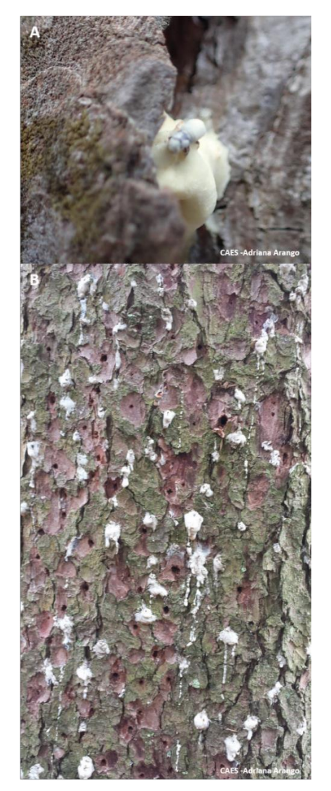
Figure 2. A. Adult beetle "pitched out" by tree produced resin. B. Visible resin along the tree trunk, and holes made by wood peckers in search of beetles.

Beetle habitat (feeding sites) on the tree is temporary because nutrients become mostly exhausted after one generation. Therefore, emerging adults must locate new host trees for feeding and reproduction purposes. During this migratory phase, these bark beetles often disperse in the absence of olfactory cues by other beetles, landing in nearby trees.