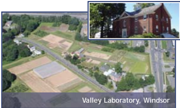
Valley Laboratory, Windsor