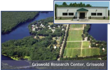
Griswold Research Center, Griswold

The Connecticut Agricultural Experiment Station is a state-supported scientific research institution dedicated to improving the food, health, environment, and well-being of Connecticut's residents since 1875.