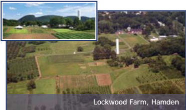
Lockwood Farm, Hamden