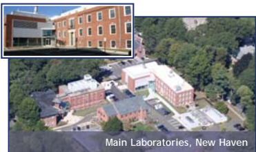
Main Laboratories, New Haven