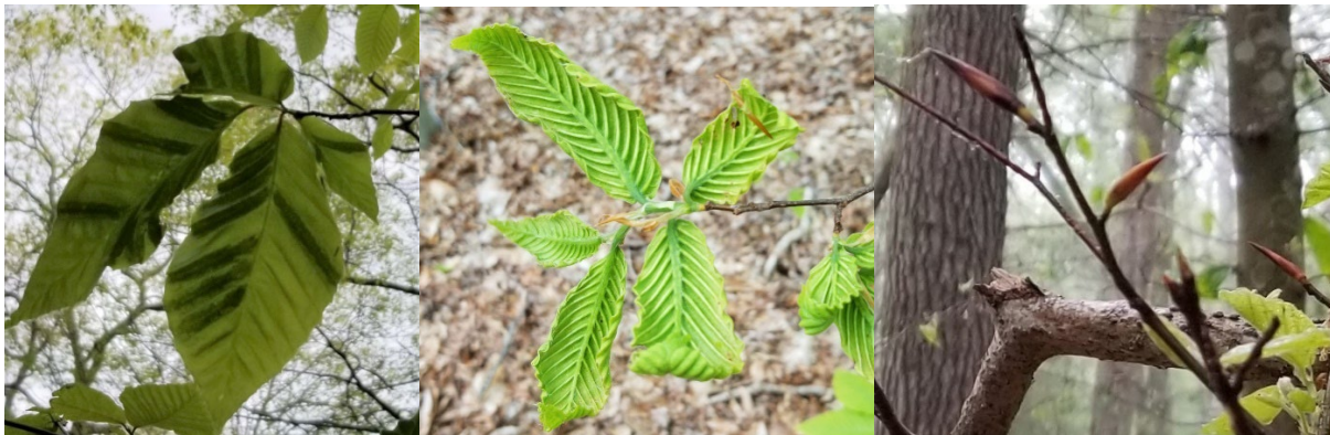
Fig. 4. Symptoms on American beech. Left, Leaf banding symptoms; middle, crinkled leaves; right, dead buds.

It's easy to determine if American beech trees are infected with BLD (Fig. 4). In the spring when new leaves are emerging from buds, infected leaves will have some dark bands between leaf veins, or the leaves will be very crinkled, smaller, and leathery. In severely infected trees, some buds won't open because the buds were killed. Banded leaf symptoms can best be seen by backlighting infected leaves against the sky.