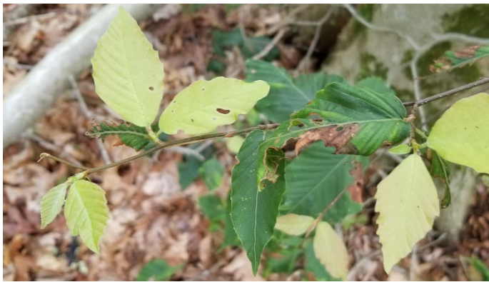
Fig. 6. Refoliated (second flush) leaves are paler and less robust than normal, healthy beech leaves.

On heavily infected trees many overwintering buds will be killed, and severely damaged leaves fall off soon after emerging in May. In late May or early June, many American beech trees produce new, second flush leaves in response to defoliation. These leaves are formed in newly produced buds. Second flush leaves don't have nematodes and do not show symptoms of BLD because they form in the absence of BLD nematodes. The new leaves are pale and thin when compared with normal, healthy leaves, and usually lack the toothed margins characteristic of first-flush leaves (Fig. 6).