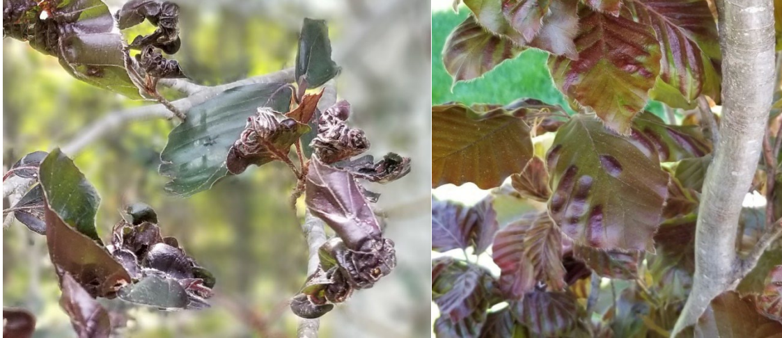
Fig. 5. Symptoms on European copper beech. Left, Tattered leaves; right, banded leaves.

On heavily infected trees many overwintering buds will be killed, and severely damaged leaves fall off soon after emerging in May. In late May or early June, many American beech trees produce new, second flush leaves in response to defoliation. These leaves are formed in newly produced buds. Second flush leaves don't have nematodes and do not show symptoms of BLD because they form in the absence of BLD nematodes. The new leaves are pale and thin when compared with normal, healthy leaves, and usually lack the toothed margins characteristic of first-flush leaves (Fig. 6).