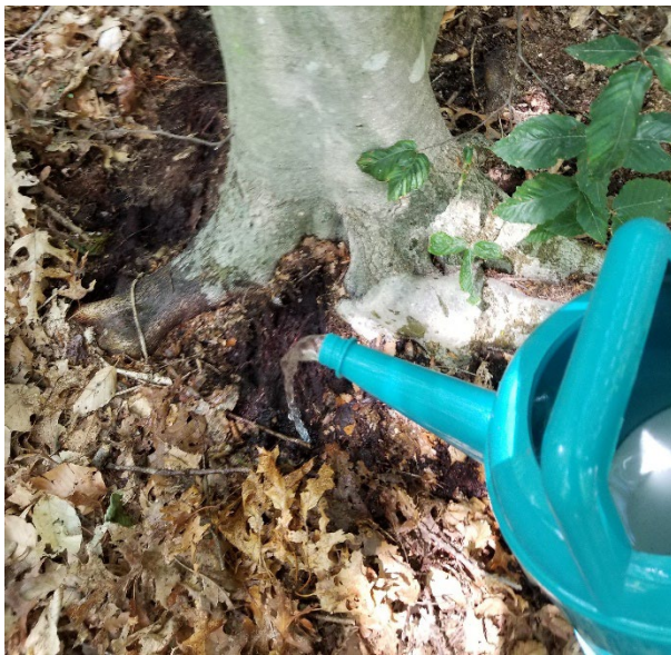
Fig. 7. Drenching a phosphite product into soil at the base of a beech tree.

Many phosphite products are sold as fungicides such as Agri-FOS, Fosphite, Reliant, Fungi-Phite, and Prophyt. Beech trees treated with either a fertilizer formulation or a product labeled as a fungicide should respond similarly. When using a fungicide formulation, you may not apply at a higher dose than allowed on the label. However, multiple applications of products labeled for plant protection use should reach effective concentrations of phosphite in tree tissues. To use a phosphite product, plan to make at least two applications between the months of May and August. Mix 2 fl. oz. of phosphite product plus 14 oz. of water per inch DBH (diameter at breast height). So, a 4-inch diameter tree will require 8 oz. of phosphite fertilizer in 48 oz. of water. Pour this around the base of the tree (Fig. 7). If the soil is dry, moisten the soil first with water so that the solution can penetrate the soil.