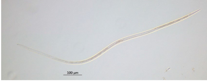
Fig. 2. Immature migrating female of Litylenchus crenatae ssp. mccannii .

Beech leaf disease is caused by a foliar nematode, Litylenchus crenatae ssp. mccannii (Fig 2.). Nematodes are microscopic worms that vary greatly in lifestyle and habitat, and not all are parasitic. We don't know where the nematodes came from, but growing evidence supports the hypothesis that this species is not native to North America. It has spread quickly, partly through rain splash, and likely also by hitchhiking on birds, squirrels, and insects. Peak emergence of nematodes migrating from leaves to buds occurs about the same time that beechnuts are ripening, which provides an opportunity for migrating nematodes interact with animals that come to feed on these nuts. We do know that the nematodes spend the winter in beech buds, that beech leaves emerge fully symptomatic in the spring, and that no further symptoms appear during the growing season. Therefore, management of this disease needs to either prevent nematodes from entering the buds or prevent nematodes that enter buds from inducing changes in leaf development.