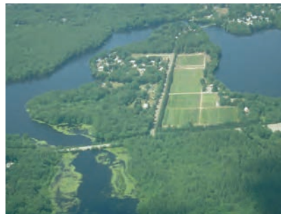
Griswold Research Center, Griswold