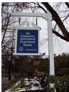
Entrance to The Connecticut Agricultural Experiment Station in New Haven on Huntington Street