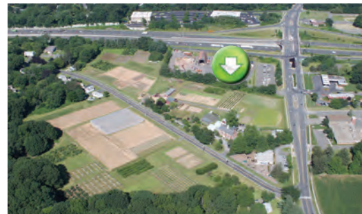
Valley Laboratory, Windsor