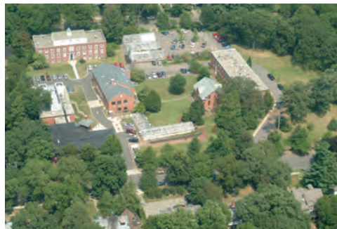
Main Laboratories, New Haven