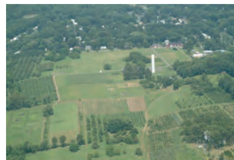
Lockwood Farm, Hamden