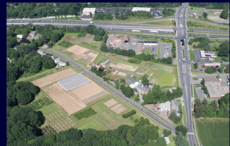
Valley Laboratory, Windsor

Valley Laboratory 153 Cook Hill Road Windsor, CT 06095-0248 Phone: 860-683-4977