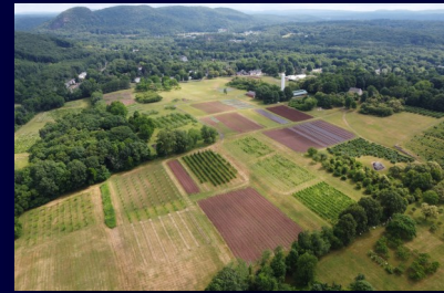
Lockwood Farm, Hamden

Lockwood Farm 890 Evergreen Avenue Hamden, CT 06518-2361 Phone: 203-974-8618