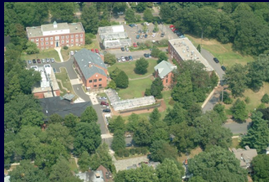
Main Laboratories, New Haven

Main Laboratories 123 Huntington Street New Haven, CT 06511-2016 Phone: 203-974-8500