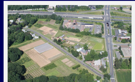
Valley Laboratory, Windsor

Valley Laboratory 153 Cook Hill Road Windsor, CT 06095-0248 Phone: 860-683-4977