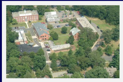
Main Laboratories, New Haven

Main Laboratories 123 Huntington Street New Haven, CT 06511-2016 Phone: 203-974-8500