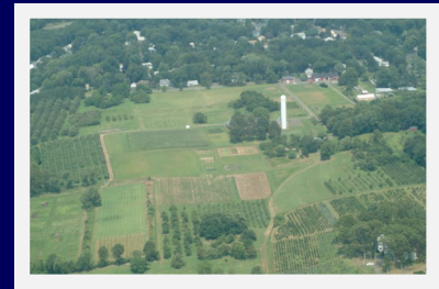
Lockwood Farm, Hamden

Lockwood Farm 890 Evergreen Avenue Hamden, CT 06518-2361 Phone: 203-974-8618