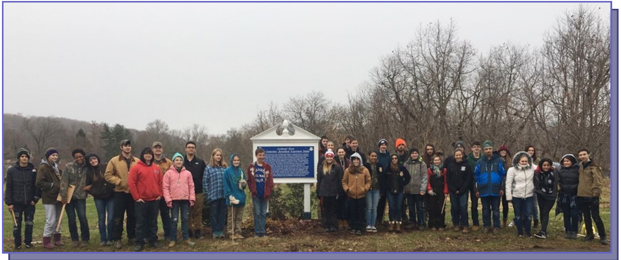
Student participants in the 2018 Connecticut-FFA Forestry Career Development Event