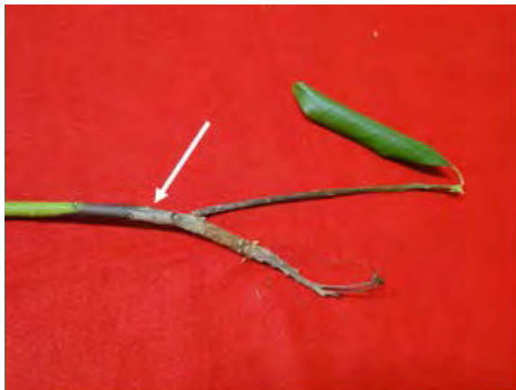
Figure 1. Dark brown cankers (arrow) on a rhododendron branch

Most common symptoms on canopies are wilting or dieback of individual branches on a tree or shrub. Sometimes cankers on stems may not be noticeable when wilt and dieback occur. Early symptoms of cankers on stems and trunks include reddish or dark brown sunken lesions, splits of barks, and uneven surfaces of stems (Fig. 1). In some cases, cankers may be surrounded and contained by callused wound wood, particularly on larger branches and trunks. As the canker develops, bark may peel and drop from the cankered area. Black fungal spore-producing structures (pycnidia) are sometimes present on diseased tissues and can be observed erupting through the bark (Fig. 2). The presence of pycnidia is an