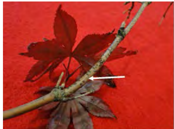
Figure 2. Black fungal fruiting bodies (arrow) on stem of Japanese maple