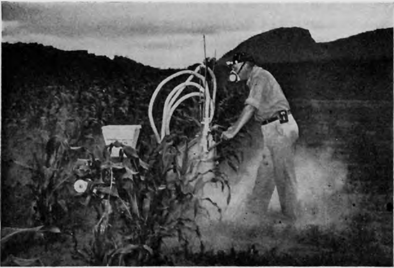
Dusting corn during the evening for control of the borer.