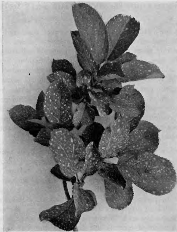
FIGURE 3. Spray residue remaining on apple foliage sprayed with modified dynamite on June 12. Photograph made September 16.

more than that. The situation for the experiment is an extremely difficult one from the standpoint of both curculio and apple maggot control. Table 11 gives the figures obtained from examination of the fruit at harvest, and indicates that the modified formula is fully as good as the straight "dynamite" sticker. The type of cover is different, however, the poison being deposited in spots instead of being continuous (Figure 3). Various growers examined the trees during August and expressed satisfaction with the foliage and fruit.