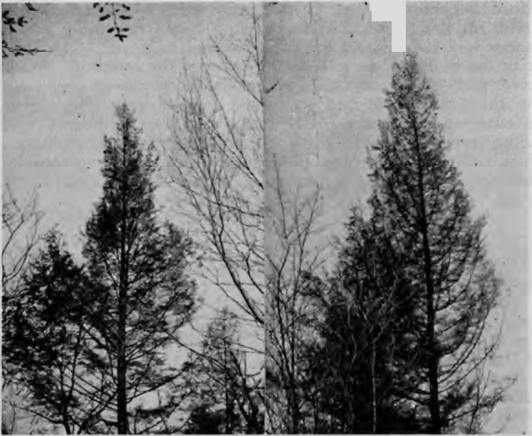
FIGURE 4. Hemlock trees at Branford partially defoliated by Ellopiathasaria Walker in 1940.

however, was not injured. Inasmuch as the survival of these trees was doubtful, the stand was cut in the late fall. At Branford about two acres were involved. The trees were about the same size and the same type of injury, although slightly less pronounced, was observed (Figure 4). The larvae of this species mature in September. It hibernates in the pupal stage, and pupae were abundant in the undecomposed litter under the trees in the winter of 1940-1941. A sample taken at Branford yielded 35 to 50 per square yard close to the bases of the trees.