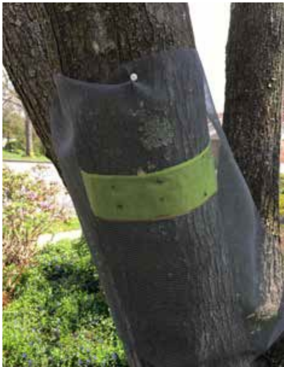
Figure 3. A banded tree covered in window screening to prevent mammal and bird bycatch. Note that the screening must remain open at the bottom to allow SLF to enter.

a after hatch and avoid bloom; b Professional licensed application only