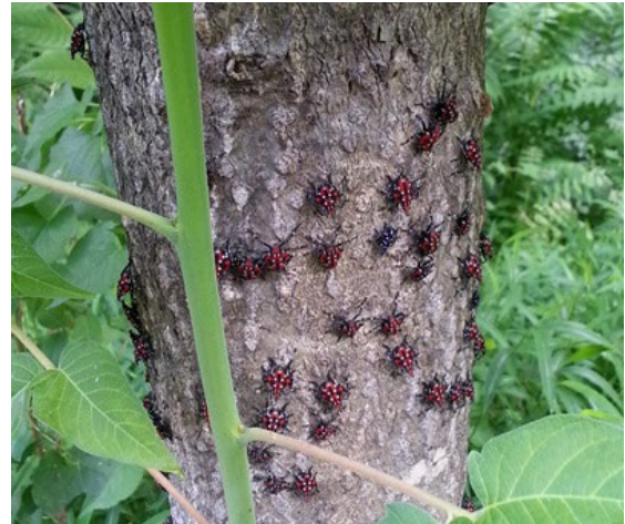
Figure 2. Late stage SLF nymphs.

Sticky bands capture SLF in sticky material as they move up the tree (Figures 2, 3). Several types of sticky bands are available for purchase online or from your local garden center. Sticky bands have a major drawback: the sticky material can capture other insects and animals , including birds, small mammals, pollinators, butterflies, and more. To reduce the possibility of bycatch, a wildlife barrier of vinyl window screening or other protective