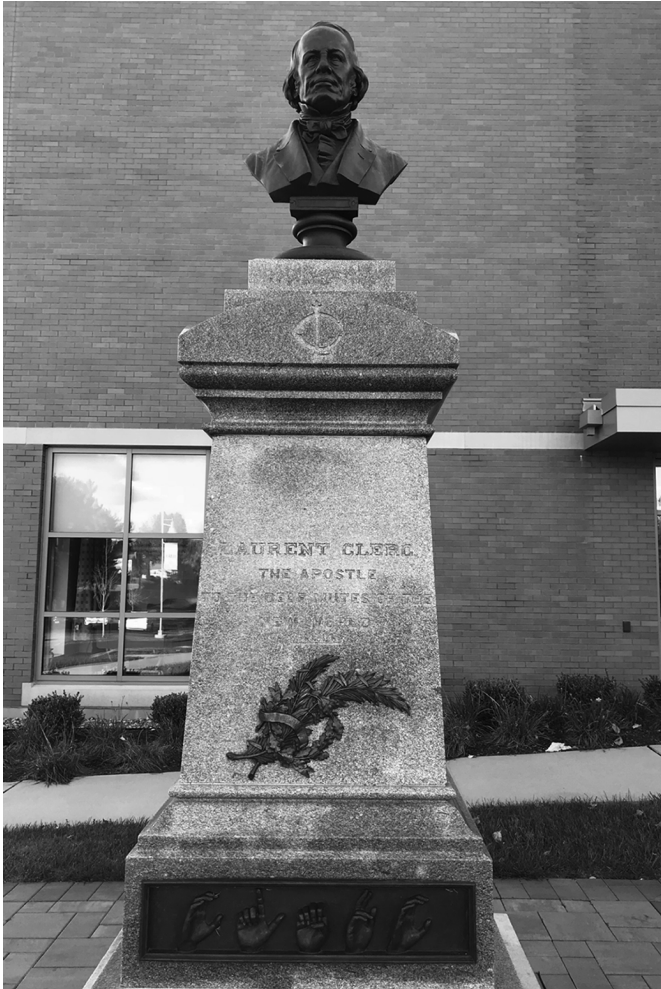
Bust of Laurent Clerc first erected at the Asylum Avenue school circa 1873 before being moved to the West Hartford school. The signs at the base of the statue spell Clerc.