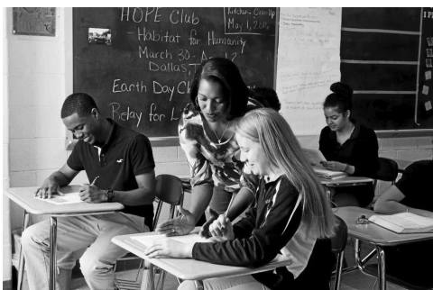
Jahana Hayes in her classroom at John F. Kennedy High School.

The idea of a teacher’s influence extending beyond the classroom is a principal tenet of Hayes’s teaching philosophy. Because her mother was