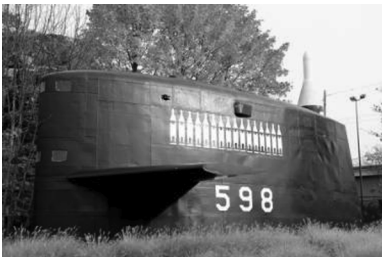
The sail of the USS George Washington , the Navy's first ballistic missile-carrying submarine.

Able to travel faster and farther than any other submarine in history, the Nautilus was home ported in New London for nearly 25 years. In 1958, she performed the first crossing of the North Pole by ship, leaving Pearl Harbor, traveling under the polar sea ice and arriving in England 19 days later. After being decommissioned in California in 1980, the USS Nautilus returned to Groton in 1985, having been designated a National Historic Landmark. Today she is an exhibit at the Submarine Force Museum. A contemporary of the Nautilus launched in 1959, the USS George Washington was another Connecticut first: the world's first nuclear-powered, ballistic-missile submarine. The arrival of this technology heralded a new era of reconstruction on Submarine Base New London that helped establish the United States as a country with immense nuclear firepower.