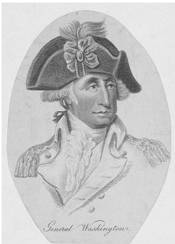
Undated print of President George Washington wearing a bicorn hat. Reproduction Number LC-DIG-pga-13807.