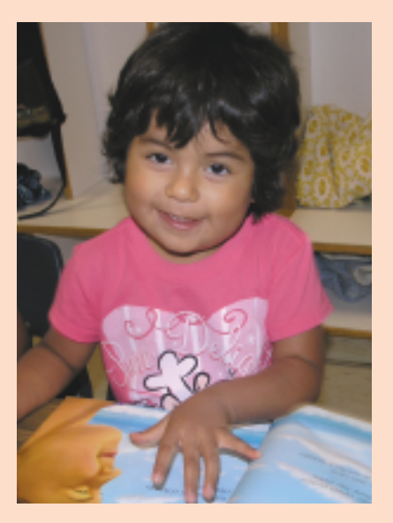
This article is translated into Spanish on page 2. Ver la versión española de este artículo en la página 2.