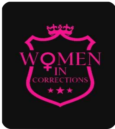
(Front of shirt)