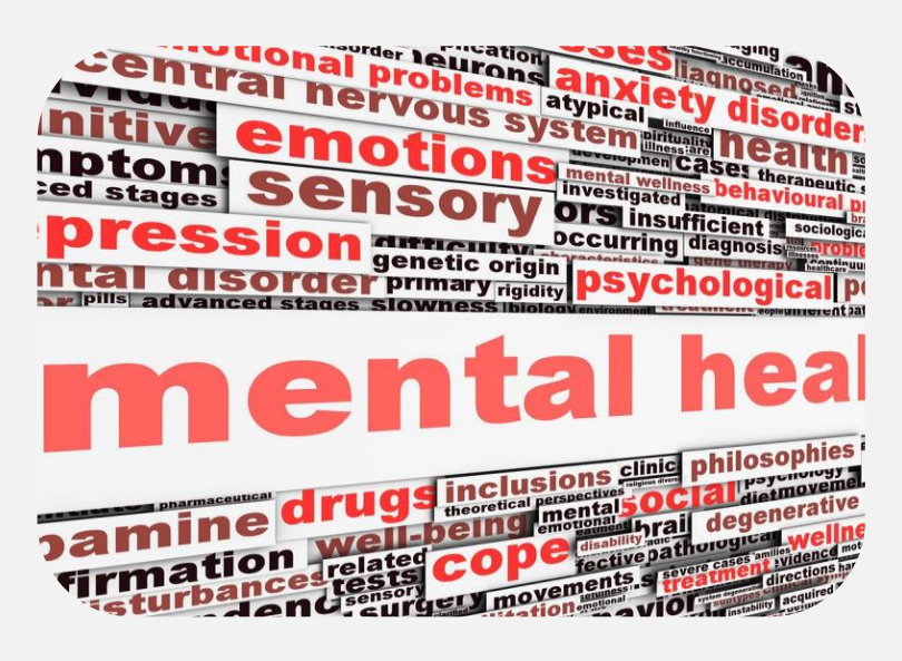
Mental Health Assessments