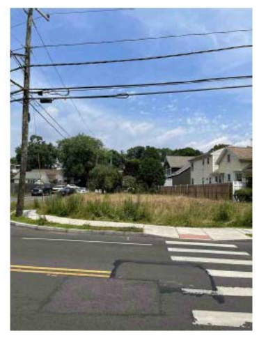
View of release parcel from Oaklawn Ave facing northerly