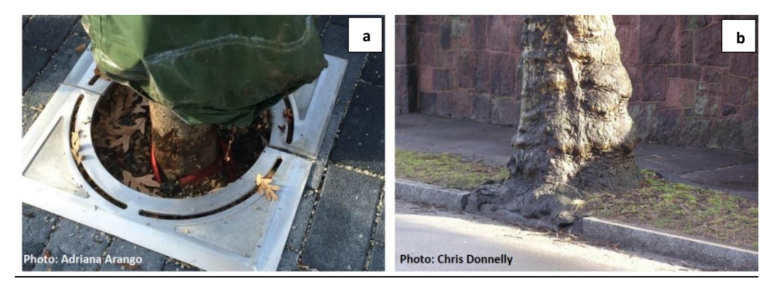
Figure 1 . Trees planted in urban areas near road sides. Recently planted white oak (a), and a mature London plane (b). Many urban trees in plazas, streetscapes and parking lots are growing in small pits (3' x 3' or 5' x 5) surrounded by pavement. Tree root system is confined belowground unless cracks or other openings are present.

Soil compaction is a common cause of suboptimal plant growth because it limits the flow of air and water through the soil, thus restricting root growth. Compaction degrades soil structure by diminishing porosity (number and size of soil pores) which decreases moisture replenishment, retention and supply; diminishes aeration; and increases the physical resistance to root penetration. Because trees are especially sensitive to both compaction and low soil oxygen levels, planting trees in small pits or adjacent to roads further impacts soil drainage and reduces the ability of plants to acquire sufficient water and nutrients needed to withstand drought (Fig. 1). Roots in compacted soils are highly branched with thicker, stubbier roots because of shallower rooting depth. Trees growing in compacted soils vary in their susceptibility to compaction stress; while some species are somehow pre-adapted to grow in dense soils (those with shallow roots), other less adapted species will try to survive by developing surface roots that can damage sidewalks and curbs (Fig. 1b).