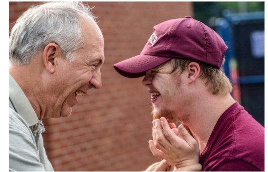
These benefits are available for Medicare beneficiaries of all ages.

All assistance is completely free and unbiased. Call today!