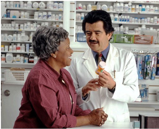
The Medicare Extra Help program can save you money at the pharmacy.